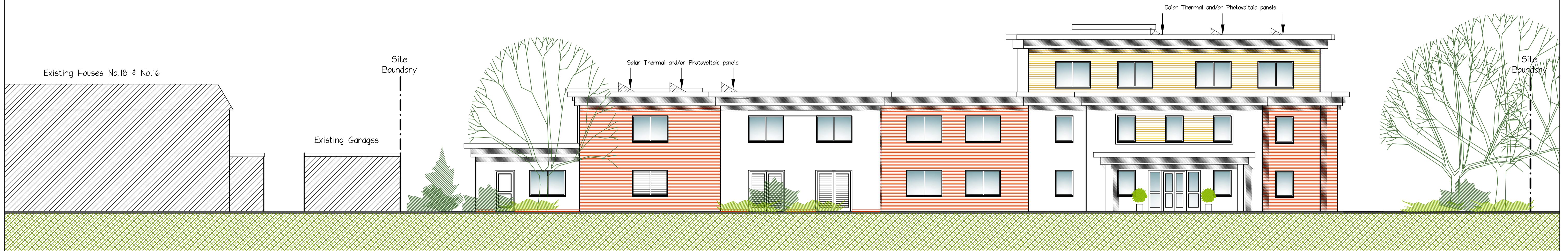
ELEVATION A - VERWOOD ROAD STREET SCENE