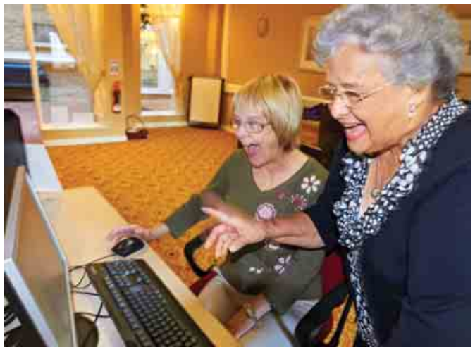
Surf the web in the Village I.T. Centre

And like most traditional villages, Shenley Wood has its own convenience shop, hairdresser, a laundry and laundrette, woodwork and craft rooms and a greenhouse.