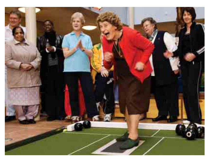
Indoor bowls is always popular

What's more, our hospitality services are on hand to make life easier and give you more time to enjoy life. We can offer help with domestic chores like shopping, ironing, laundry and cleaning, and those D.I.Y. jobs around the home, on a pay as you go basis.