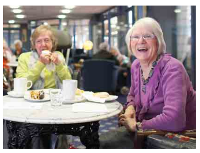
Enjoy the company of friends and neighbours