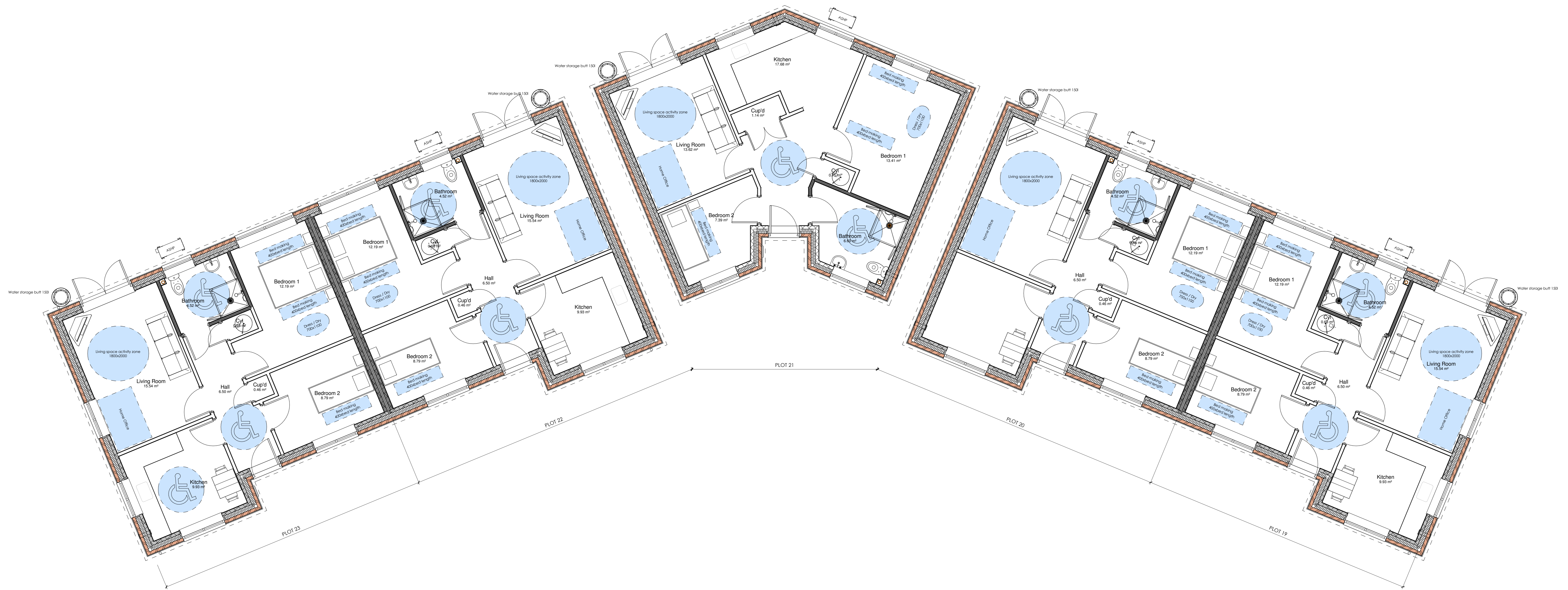
Ground Floor G.A Plan 1 : 50