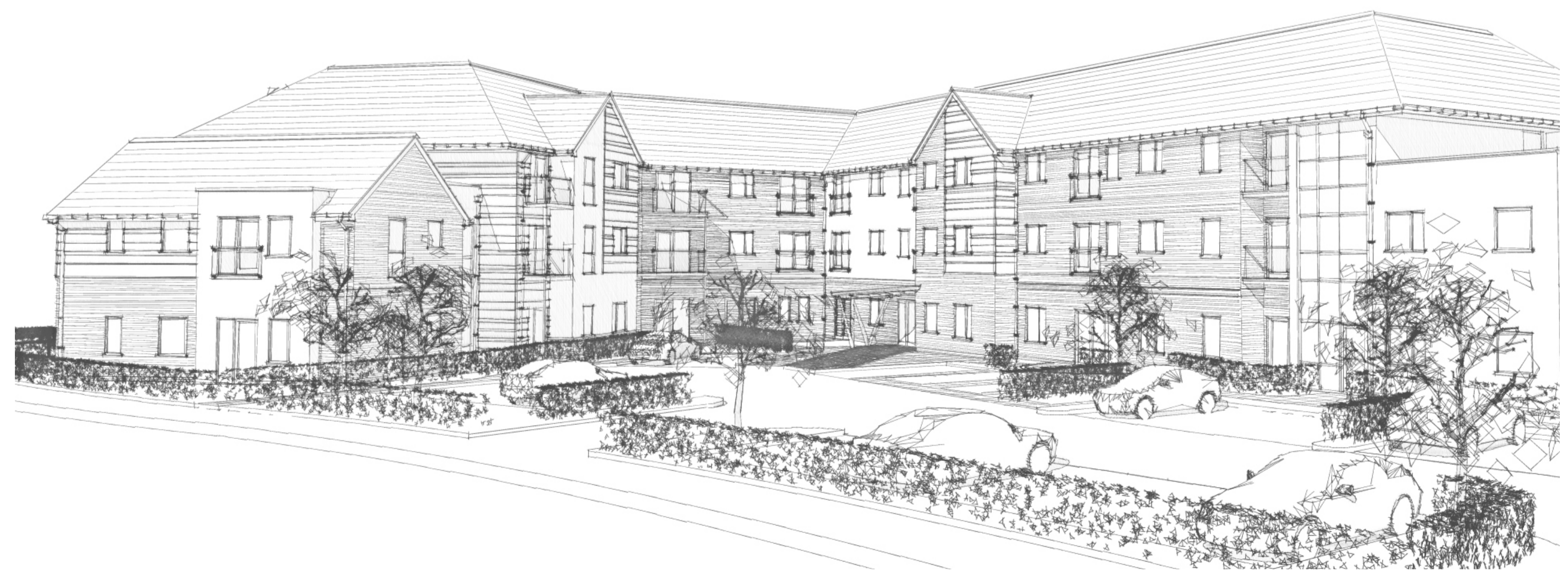
3D view of main entrance / approach