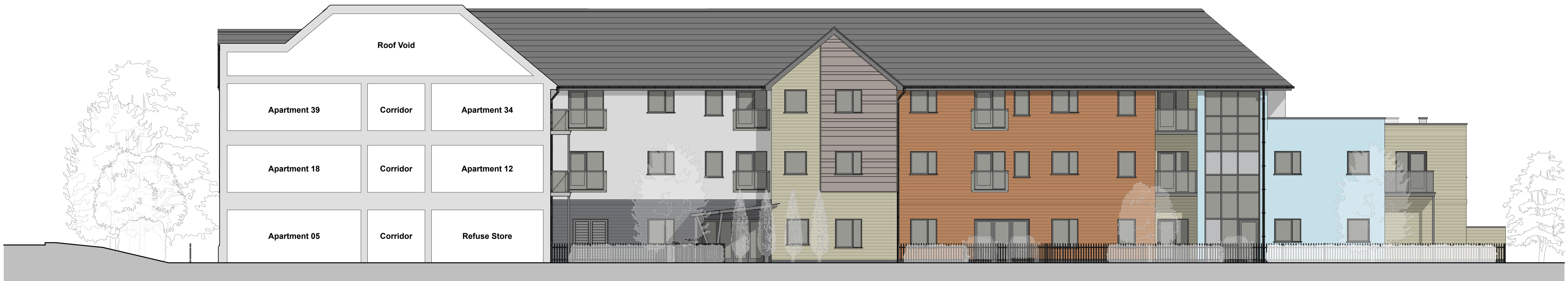
elevation 03 - entrance courtyard A