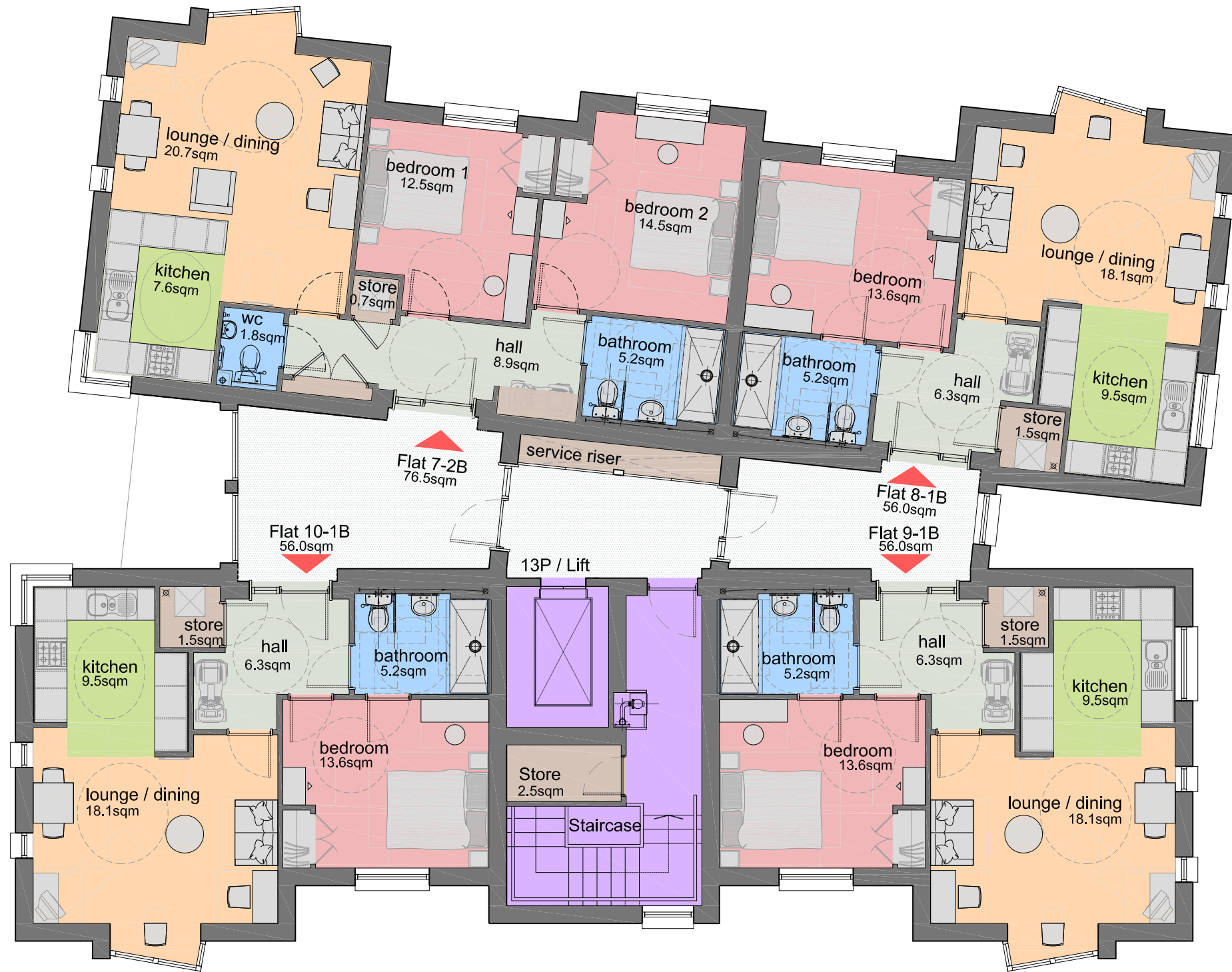
SECOND FLOOR PLAN Apartments 7 to 10, Store