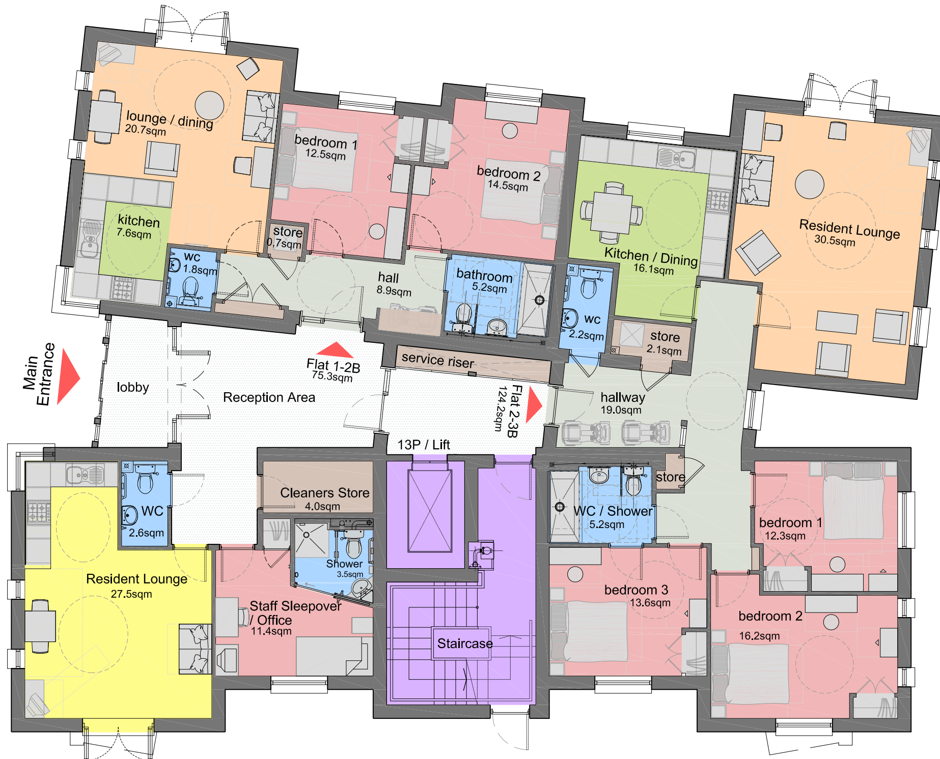
GROUND FLOOR PLAN Apartments 1 to 2, Resident Common Lounge, Staff Sleepover & Cleaners Store