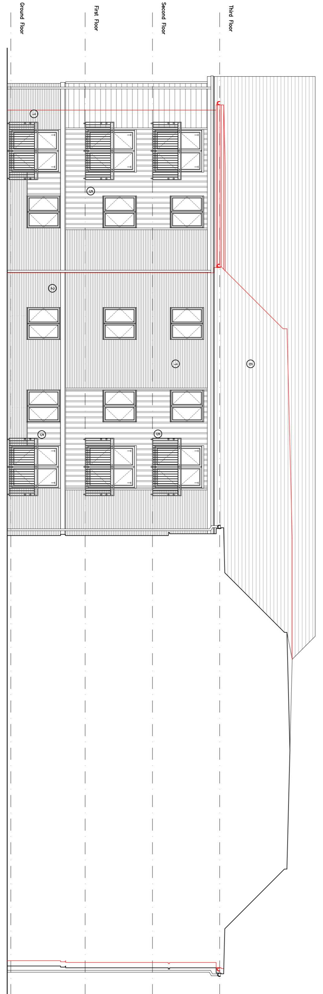
SOUTH-EAST FACING COURTYARD ELEVATION