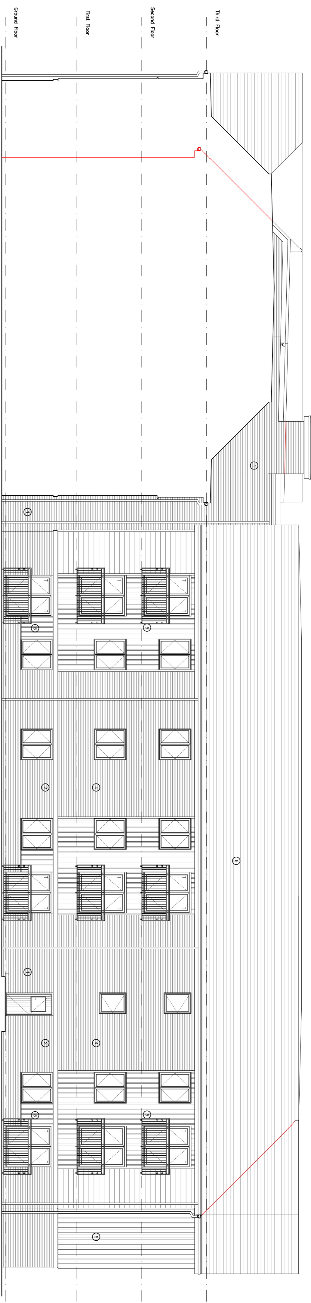
NORTH-WEST FACING COURTYARD ELEVATION