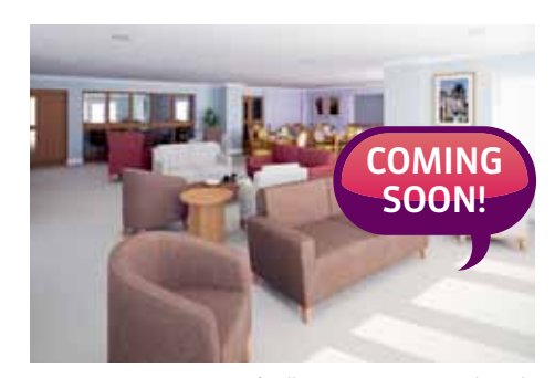
Artist's impression is for illustrative purposes and is only representative of final furnishings and finish.

Orchard Fields – Extra Care scheme in Banbury has 20 two bedroom apartments. Of these, 20 are available to purchase on shared ownership and 19 to rent. bpha is working in partnership with Oxfordshire County Council and OSJCT. This development was completed in May 2011.