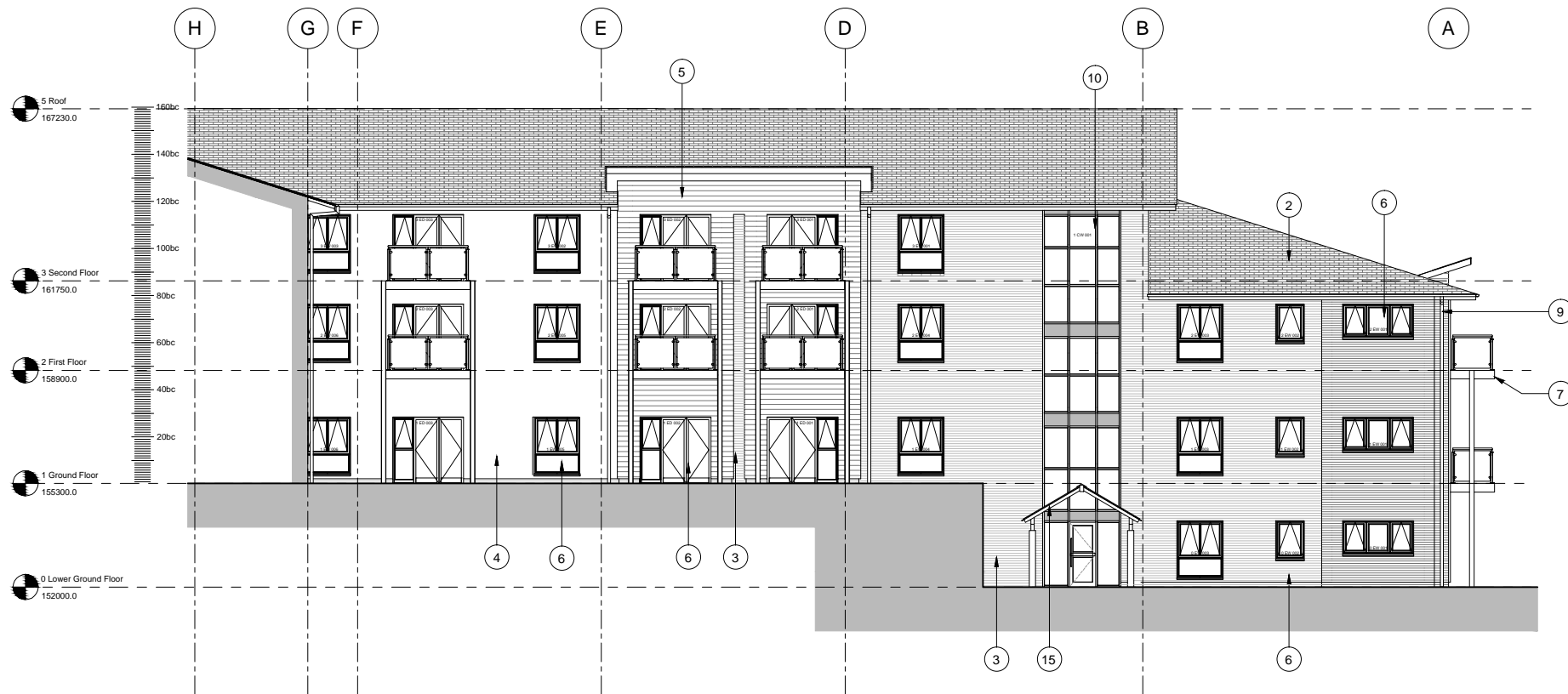
6 NORTH GARDEN ELEVATION 1 : 100