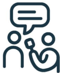
Activity 2 A long distance connection