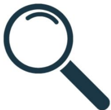
Activity 1 'I spy' from afar

This week's Buddies activities are all about how we keep in touch with our friends and family members when we're not in the same place. With your older friend or family member, you'll do: