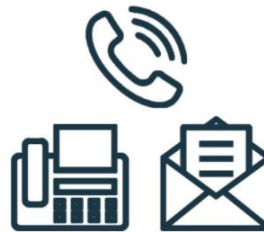
Activity 3 Keeping in touch through the years