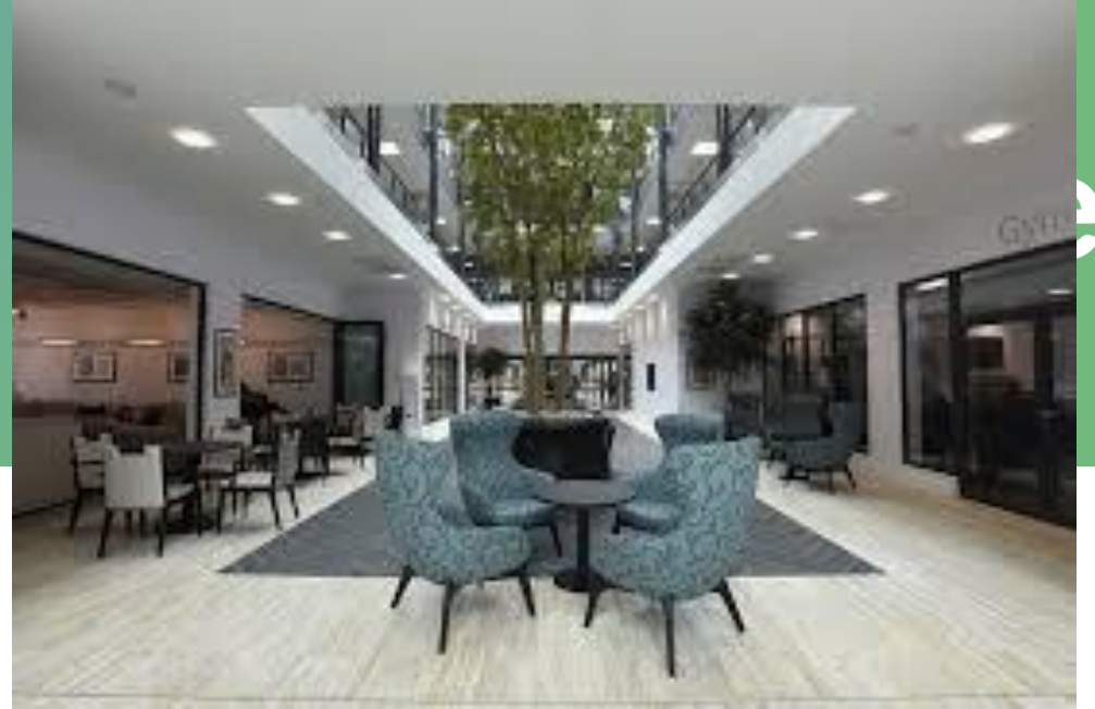
Jim Leftwich Hughenden Gardens Village