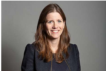
The Rt Hon Michelle Donelan MP

Secretary of State for Science, Innovation and Technology