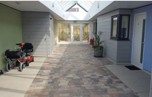
Thorngate Churcher Trust, Gosport, New-build enhanced sheltered housing