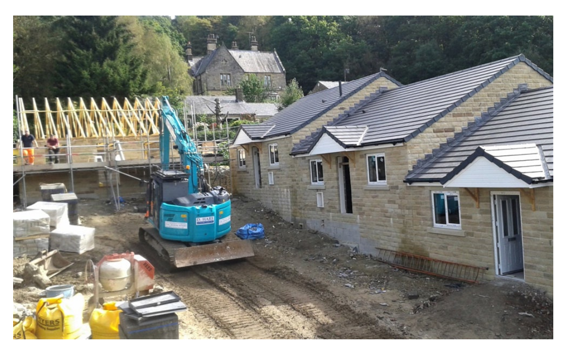
New bungalows under construction, 2019

John Eastwood Homes is a mid-20th century almshouse foundation, with 12 bungalows (built 1962-2000) in the village of Walsden and two of the six new bungalows completed in February 2020. Calder Valley Community Land Trust (CVCLT, incorporated in 2014) is part of the fast-growing community-led housing network and (unusually for a CLT) a Registered Provider and Homes England Investment Partner.