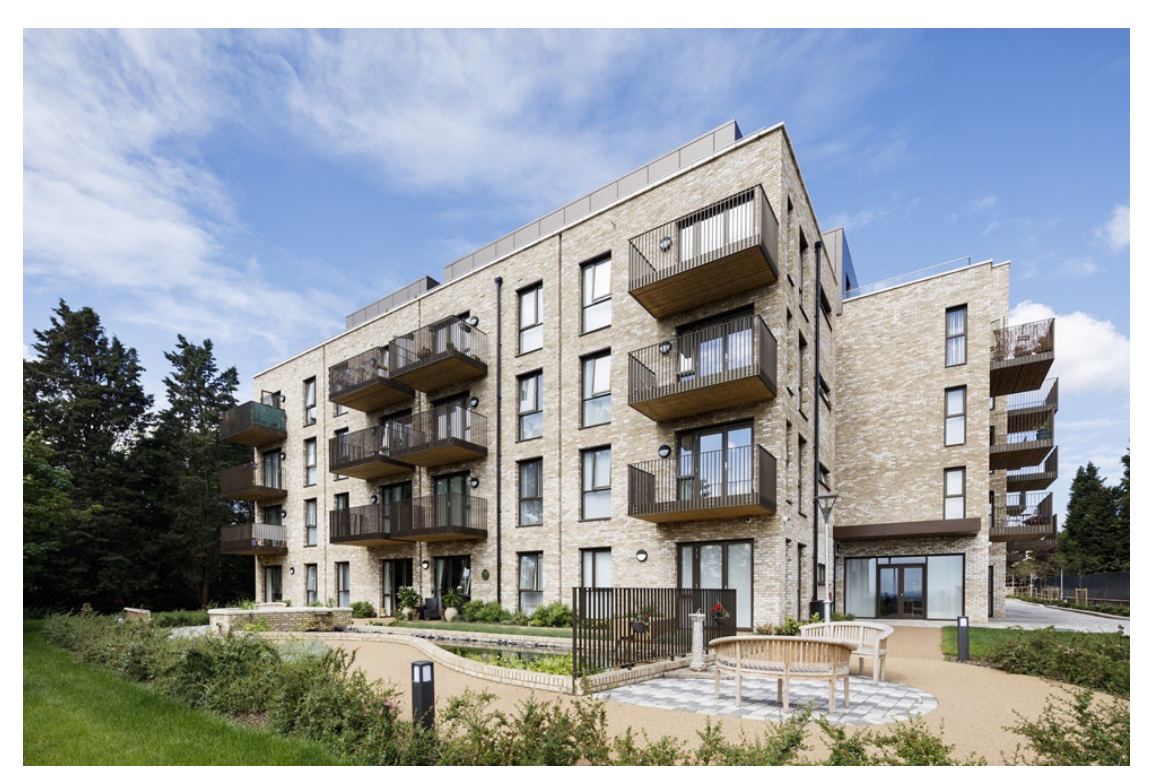
New almshouse, garden and pond

Remodelling to create one-bed flats was too expensive and no alternative site could be found. By 2008, the decision was taken to demolish and redevelop: the valuable site has extensive views to London and Kent, with room for private housing for sale. Crest Nicholson made the best offer: the design placed the new almshouse at the head of the site with town houses and apartments round a square. The deal was to build the new almshouse first so that existing residents could move in. Then the old building was demolished, the charity received a substantial additional payment and the rest of the site was passed over to Crest Nicholson to build their housing for sale. St Clement's Heights (completed in 2017) has 50 spacious flats to London Design Guide and HAPPI standards with balconies or patios, communal areas and private gardens, and a resident manager.