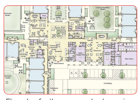
Floorplan for the proposed scheme in Feltham

In LB Richmond, Paragon are working with the local community to develop housing in which people with autism and learning disabilities can live independently with support from care workers, families and friends. A model using the disposal of small council owned plots and funding from a range of sources (including round one of the MASSH administered by the GLA). We will follow this with interest.