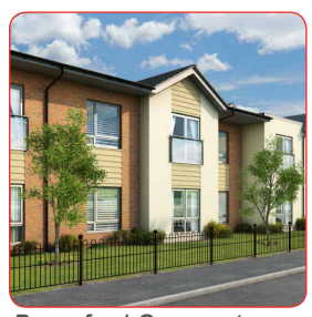
Beresford Crescent, Middlesbrough

two bedroom bungalows, all with level access