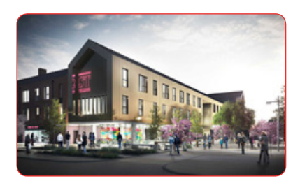
The forthcoming Shrewbury Street development in Manchester

Last month, the Housing LIN held the first meeting of our regional NW Leadership Set. We are honoured to have attracted such a wealth of experience and enthusiasm to join our group. We hope in future meetings to develop our vision and determine how the group will influence the local and national agenda on health, housing and social care.