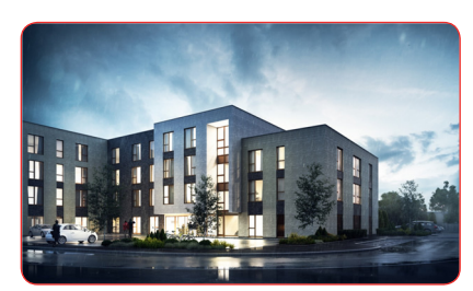
The new development on Sutton Way, Ellesmere Port

And in Ellesmore Port, Magenta Living is working in partnership with Cheshire West and Chester Council, on a CASSH funded Extra Care Scheme.