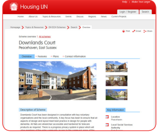
Directory of DH funded schemes on the HLIN site

Furthermore, successful bidders will be required to supply the Housing LIN details of their completed developments so that they can be showcased on our directory of Department of Health funded schemes and local innovation shared across housing, health and social care communities.