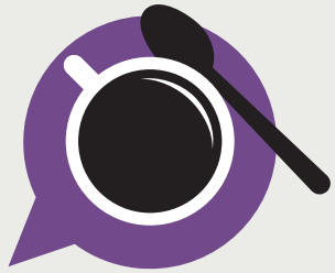
Figure 2: What makes us healthy?