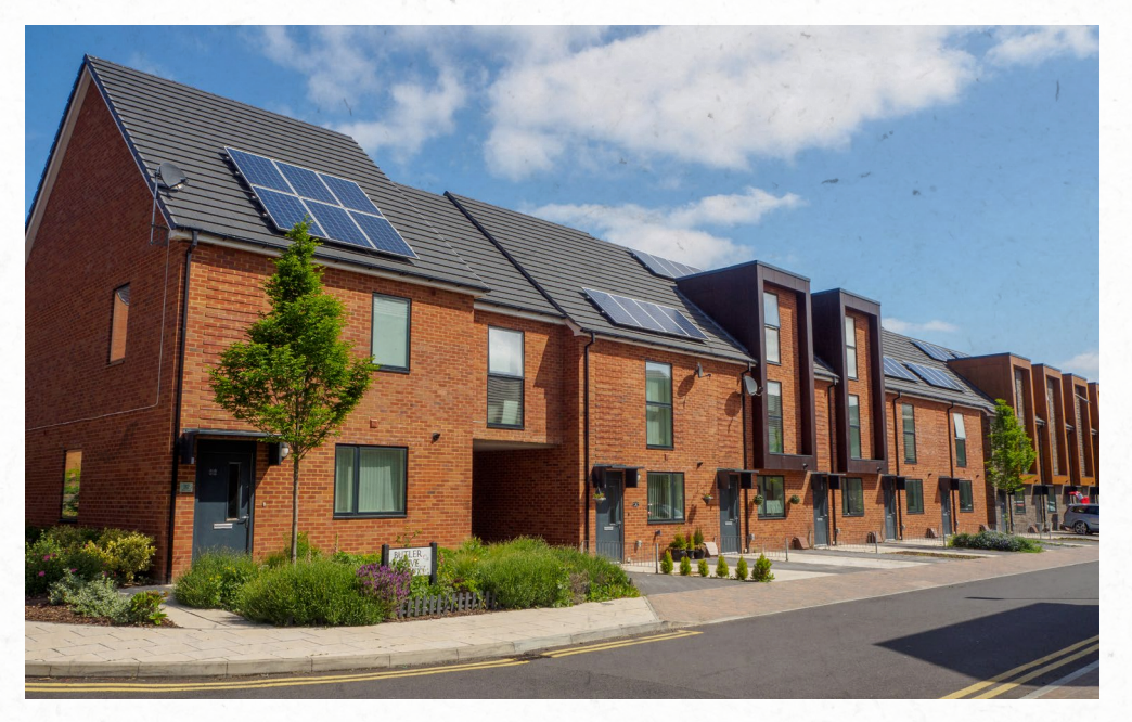
Orbit's Erith Park development

The next stage will look at self-generation and storage of electricity through the primary mechanisms of solar or wind generation on either an individual or a scheme-based level. However, industry commitments to decarbonise the electricity grid may result in a zero carbon supply, so to allow time for such developments, the renewable element of Orbit's plan is focussed on works post-2040.