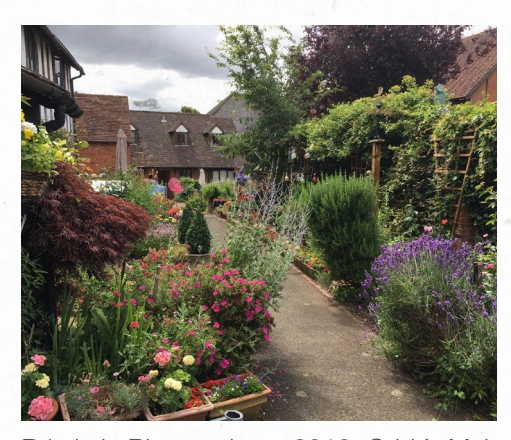
Britain in Bloom winner 2019, Orbit's Malt Mill Lane, Stratford-upon Avon

challenge ahead of us demands nothing less. While government can provide investment and the right policy framework, in partnership we as providers need to implement that change. Our guide for social landlords, published next year, will set out how we do that.