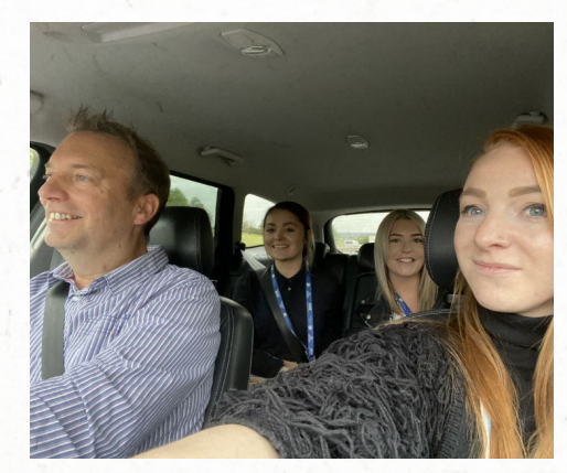
Orbit's car sharing scheme