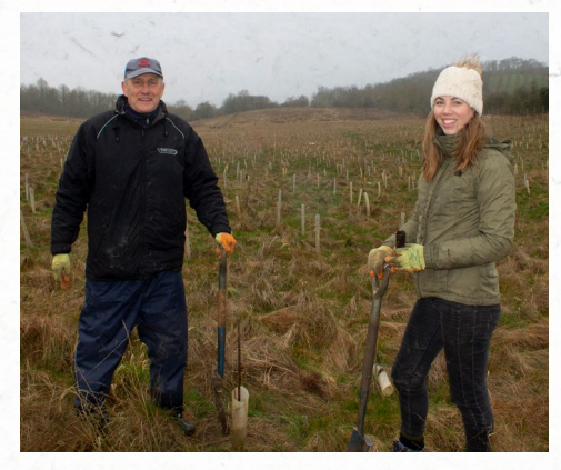
Orbit's employees volunteer to plant trees