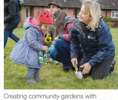
Orbit residents in Stratford