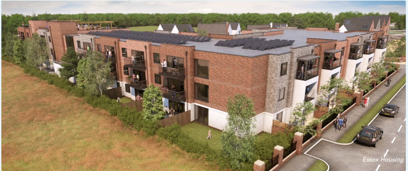
CGI of the Rocheway housing development