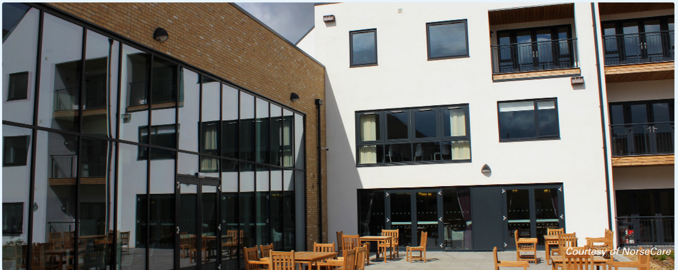
Part of Bowthorpe Care Village