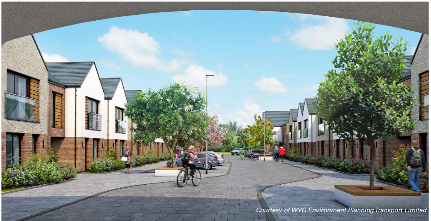
Proposed housing development at Baldock