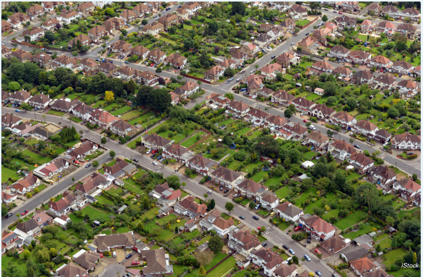
Housing in Surrey