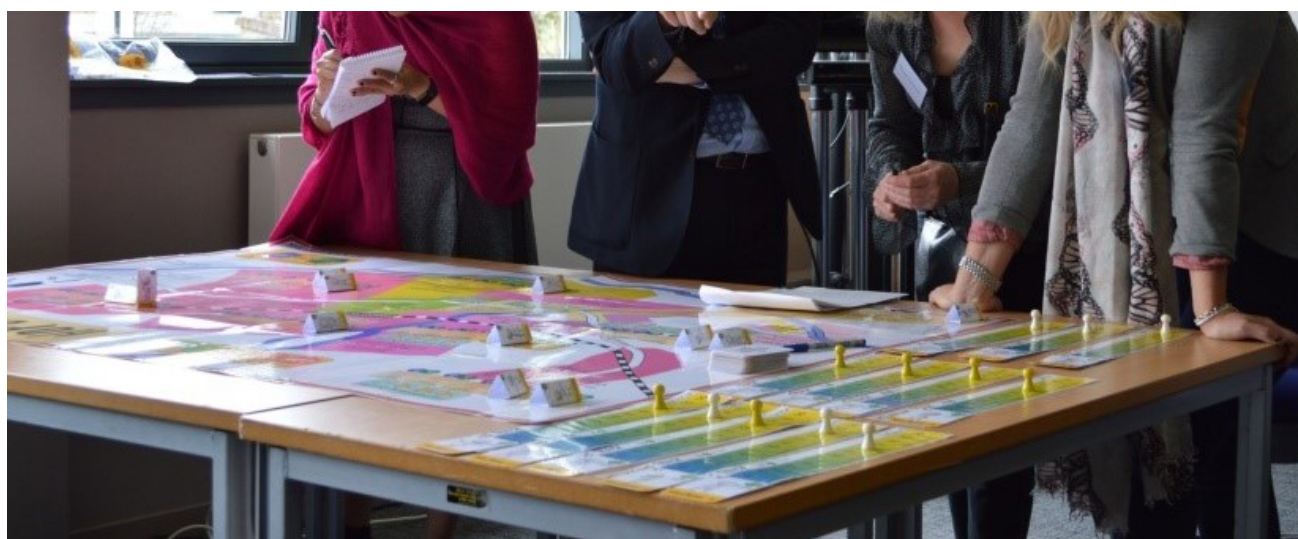
Figure 1. Participants playing the 'Serious Game.'

Participants in each workshop were randomly allocated to four groups with different roles and remits (policy makers, older people, developers and service providers).