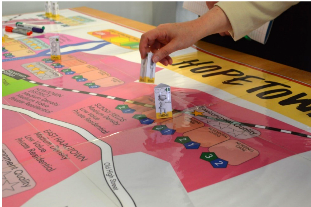
Figure 3. An example of a counter on the board representing a fictional character, Irene.

Each group had a designated facilitator, as well as a note taker drawn from the research team whose task it was to document the process through observational field notes.