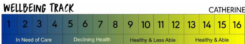
Figure 2. Wellbeing track for people in Hoptown.