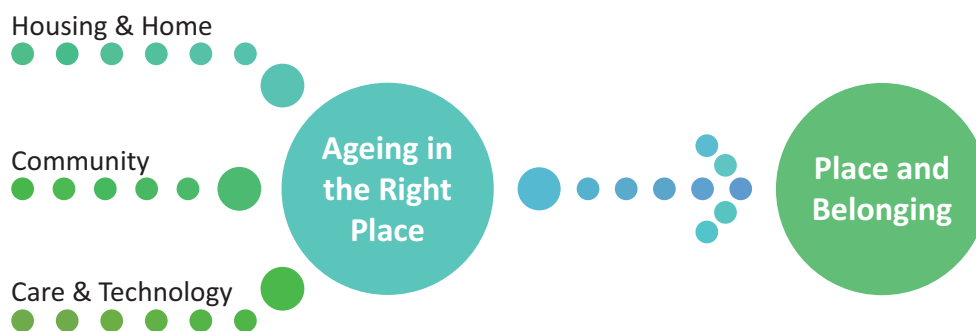
Figure 5. Thematic framework for the Housing and Ageing programme.

There was constant negotiation over power and team dynamics, prioritising the perspectives of those with financial weight at the expense of other actors around the table, as exemplified in a dialogue among the older people’s team in game 1: