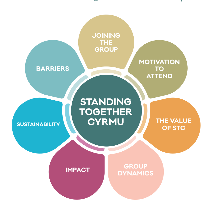
Figure 1. Summary of themes from the STC qualitative evaluation.

For clarity the comments made relating to the pandemic have been separated from the main body of the findings. This is so as not to skew what was already emerging from the data as well as highlight the impact of the pandemic on the residents. See Figure 1 for a summary of themes from the qualitative analysis.