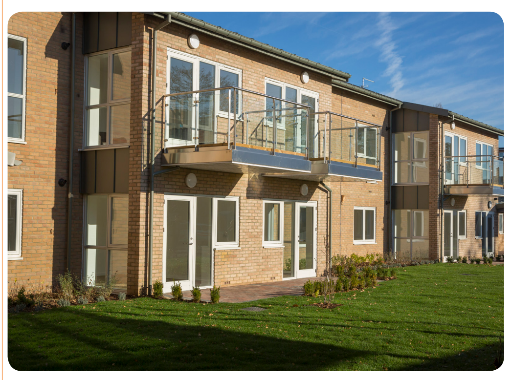
Habinteg's new development in Hounslow, Goodrich Court, is a high specification example of mainstream inclusive housing design

As a responsible housing sector, we must commit to delivering inclusive homes and communities that meet a wide range of needs. Whether for families with young children, somebody returning home after a hospital stay, a young disabled person looking to move for employment, or an older person with increasing mobility impairment, providing accessibility and flexibility in all new homes should be one of the key tests against which our social value will be measured.