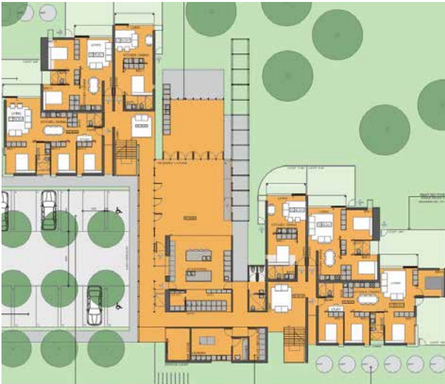
FLOOR PLAN, Murundaka, (From Iain Walker's ESRC seminar presentation).