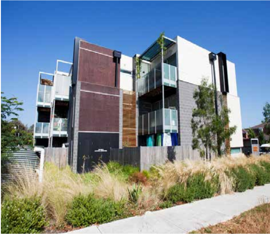
MURUNDAKA COHOUSING, part of CEHL, Melbourne, Australia, founded in 2009, completed November 2011