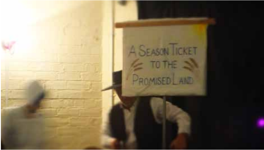
DIGGERS AND DREAMERS roadshow, Newcastle