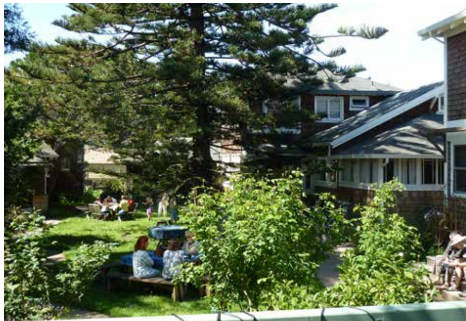
SHARED OUTDOOR SPACE at Berkeley Cohousing, CA, USA.

Berkeley Cohousing was created on a family farm dating back to about 1900. It now consists of 15 units, mainly cottages and duplexes, and offers one solution to the exceptionally high house prices and rents that characterise the wider San Francisco Bay Area. The group has a “limited equity” arrangement with the city that restricts price appreciation to area median income growth plus capital improvements, for 30 years from each resale; buyers have to earn less than 120 or 150 percent of area median income. As a result, prices are now around 50 percent below market, and turnover is very low, with only a single resale every 8-10 years. Sellers are free to select buyers subject to the above restrictions. After 18 years, half the founders still live in the community, sharing three meals per week, participating in cooking and cleaning rotas, taking part in monthly general meetings and working on a committee. Members of Berkeley Cohousing are closely involved in the proliferation of retrofitted cohousing and various forms of converted, tiny-house and hybrid live-work housing initiatives in the Oakland area of California and also across Oregon. A good example is SquareOne Villages which create self-managed communities of cost-effective tiny houses for people in need of housing: http://www.squareonevillages.org/