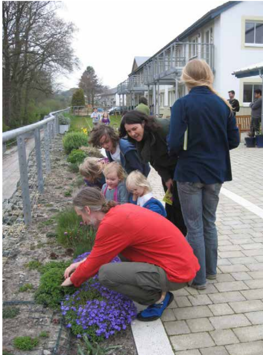
FORGE BANK COHOUSING in Lancaster, UK is an intergenerational project with high ecological standards