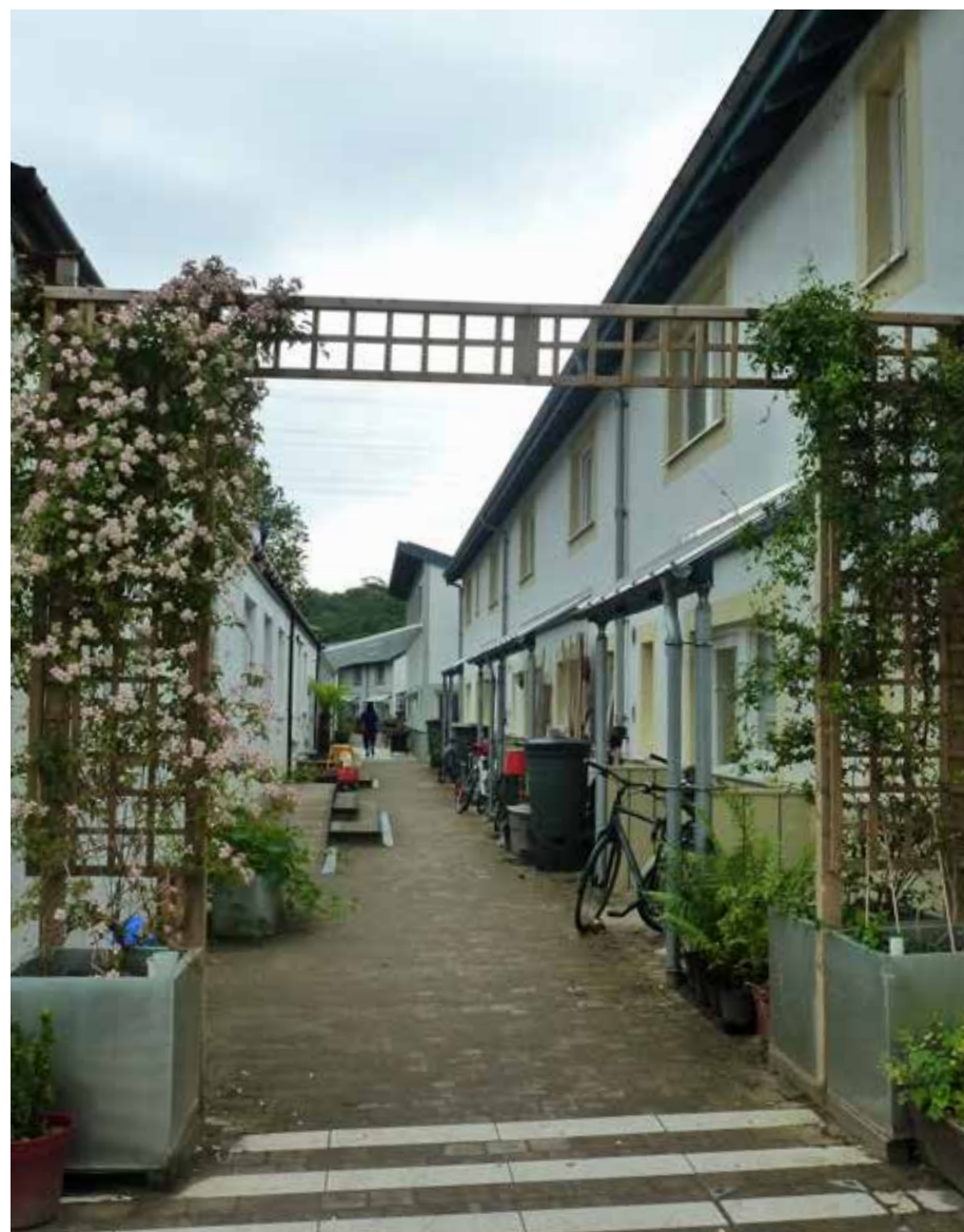
THE CENTRAL PEDESTRIAN AXIS at Lancaster Cohousing.

Lancaster Cohousing: an inter-generational cohousing community with individual houses, flats, homes, community facilities and workshop/office space. It is built on ecological values that foster environmental sustainability with new buildings achieving Passivhaus standard and meeting the requirements of Code for Sustainable Homes Level Six. http://www.lancastercohousing.org.uk/Project