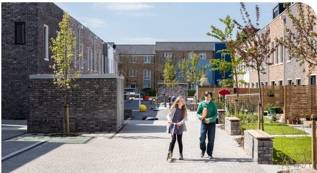
Marmalade Lane – Mole Architects

This report illustrates that well-designed built environment 'hardware' can go some way to encouraging people out into their local areas and to making it more likely they will encounter and interact with others. But our examples also show that sometimes planned interventions need to be combined with physical infrastructure to bring about the degree of social contact which is likely to be necessary for bringing about reductions in loneliness. Substantial funding will be needed