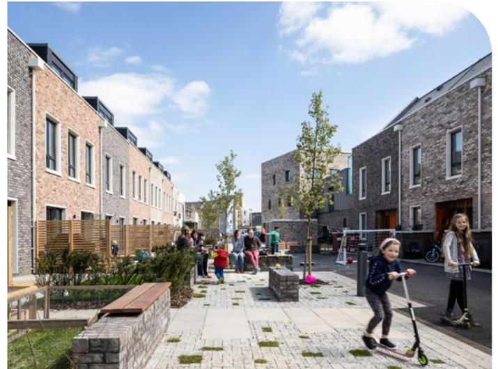
Marmalade Lane – Mole Architects

conversations. 35 Housing developments designed for older people according to HAPPY (Housing our Ageing Population Panel for Innovation) principles, also include walkways and outdoor seating designed to encourage interaction between residents and with people from the wider neighbourhood. 37