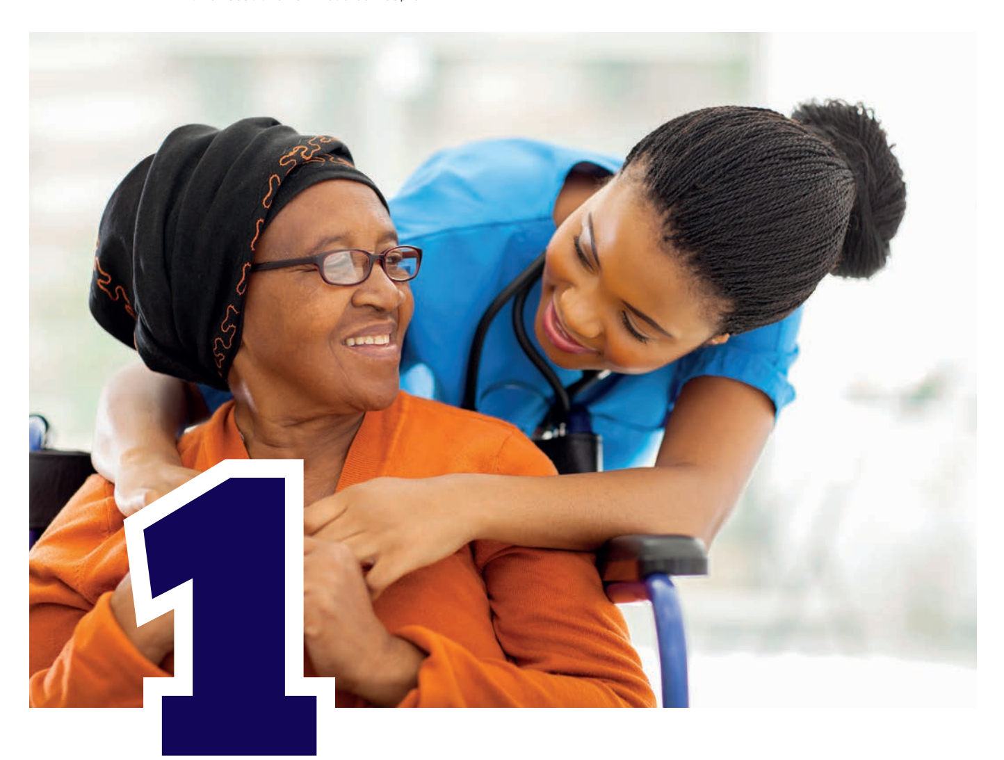
Our ambition: Support services that meet disabled people's needs