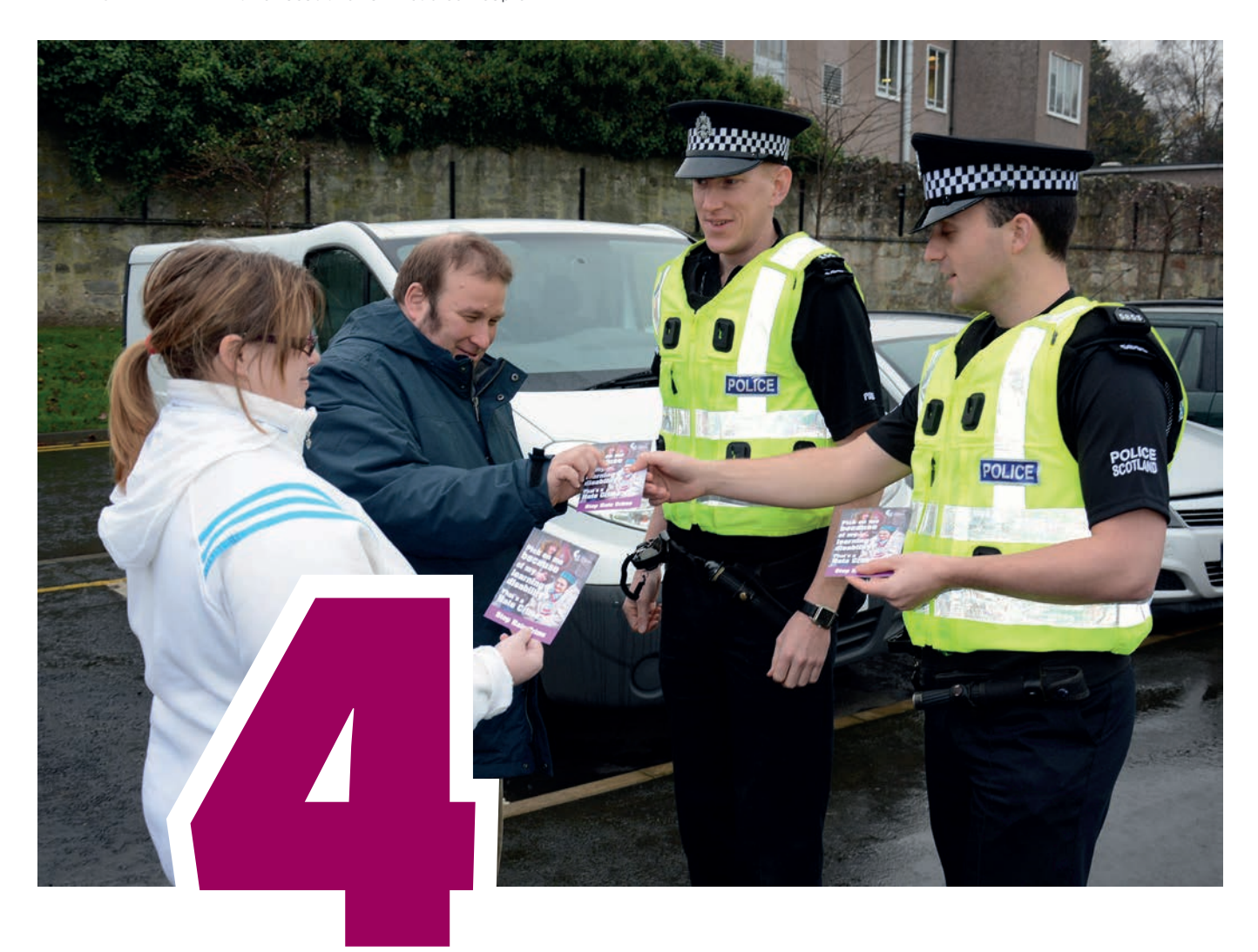
Our ambition: Protected rights