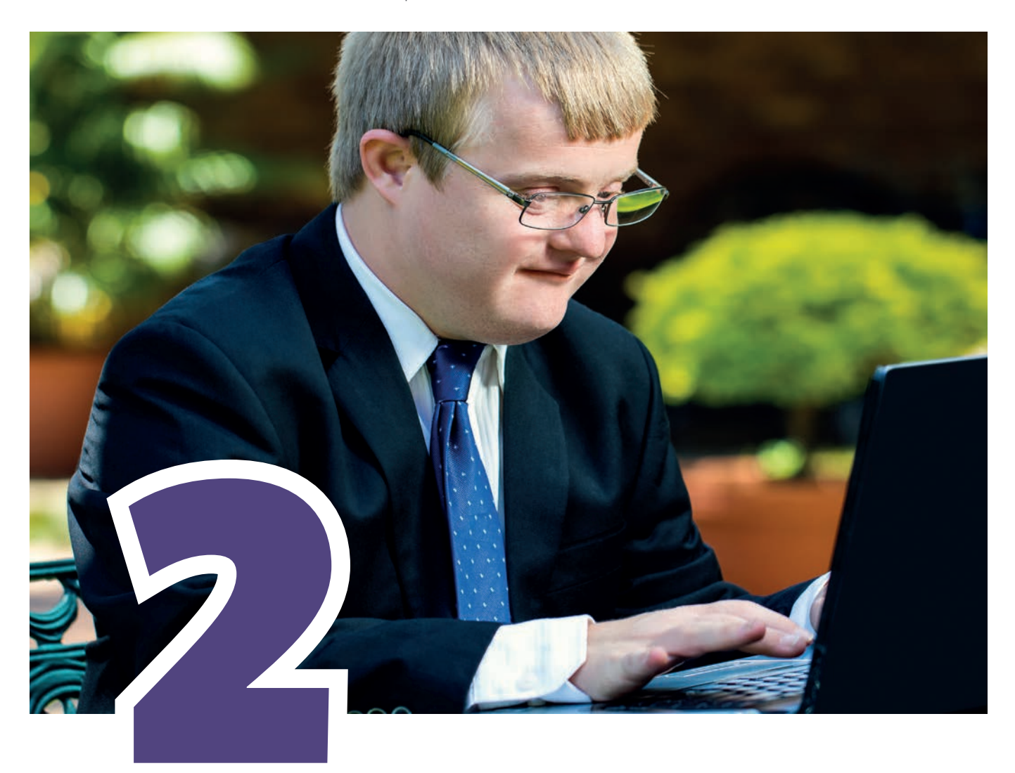
Our ambition: Decent incomes and fairer working lives