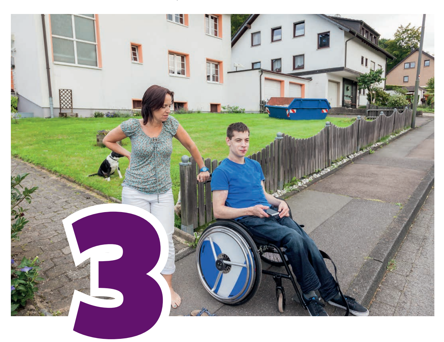
Our ambition: Places that are accessible to everyone