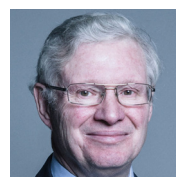
Lord Nigel Crisp Independent crossbench member, House of Lords; Co-chair, All-Party Parliamentary Group on Global Health, UK