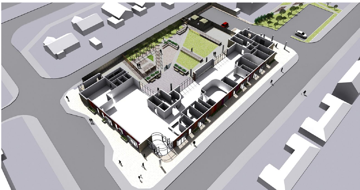
3D Render of place : architecture's Barratt Court Extra Care Housing Project

A further interesting field is the utilisation of BIM information as a part of facilities management. The potential benefits in this area are huge. Information such as maintenance requirements, parts replacement details and lifetime expectancy can all be integrated into the modelled information, allowing housing associations / developers to quickly assess maintenance implications and monitor lifecycle costs for large numbers of building assets from a centralised remote location.