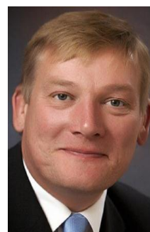
Kris Hopkins MP, Minister for Housing