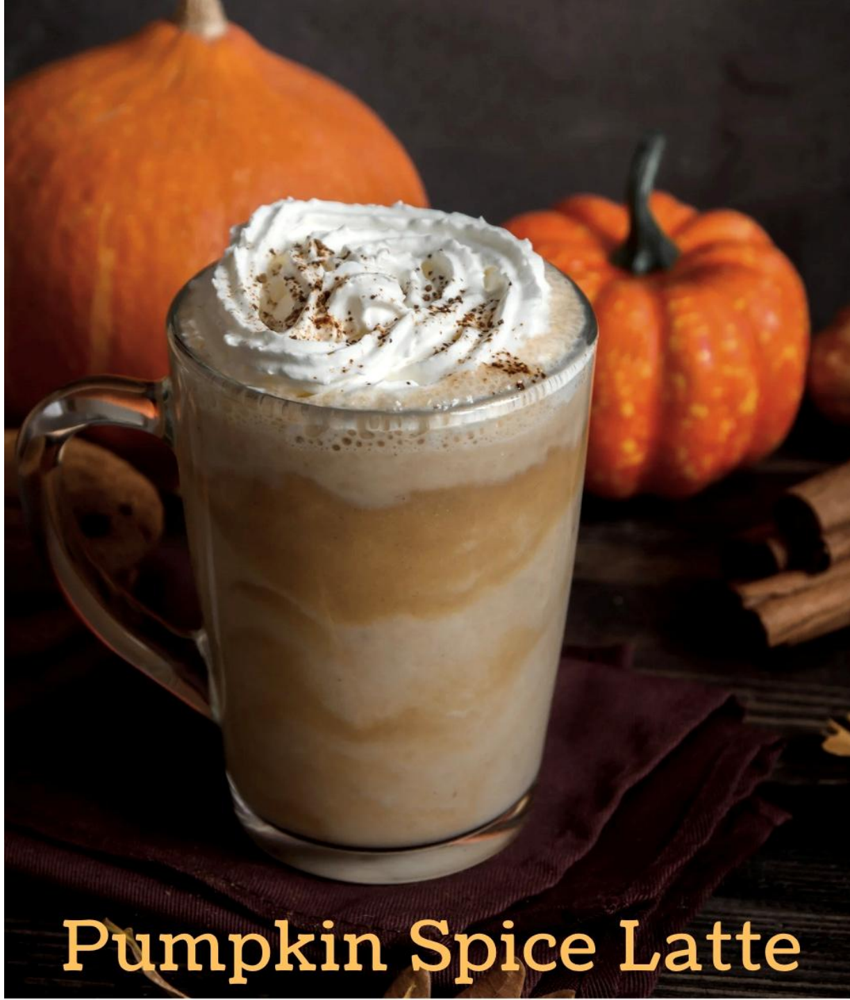
Pumpkin Spice Latte