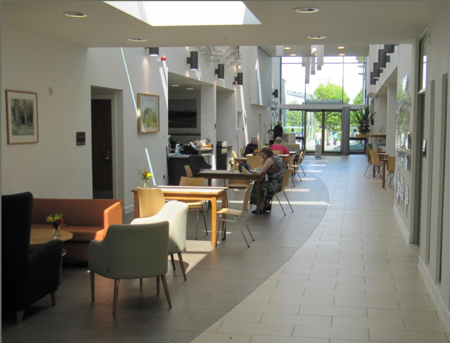
Street/entrance atrium, St Wilfrid's Hospice, Eastbourne RH Partnership Architects