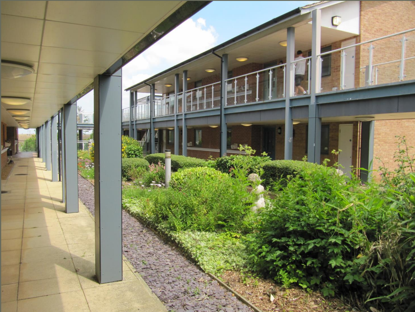
Lark Hill, Nottingham. Number of homes: 327 homes (255 apartments & 72 bungalows) with 470 residents in 2022