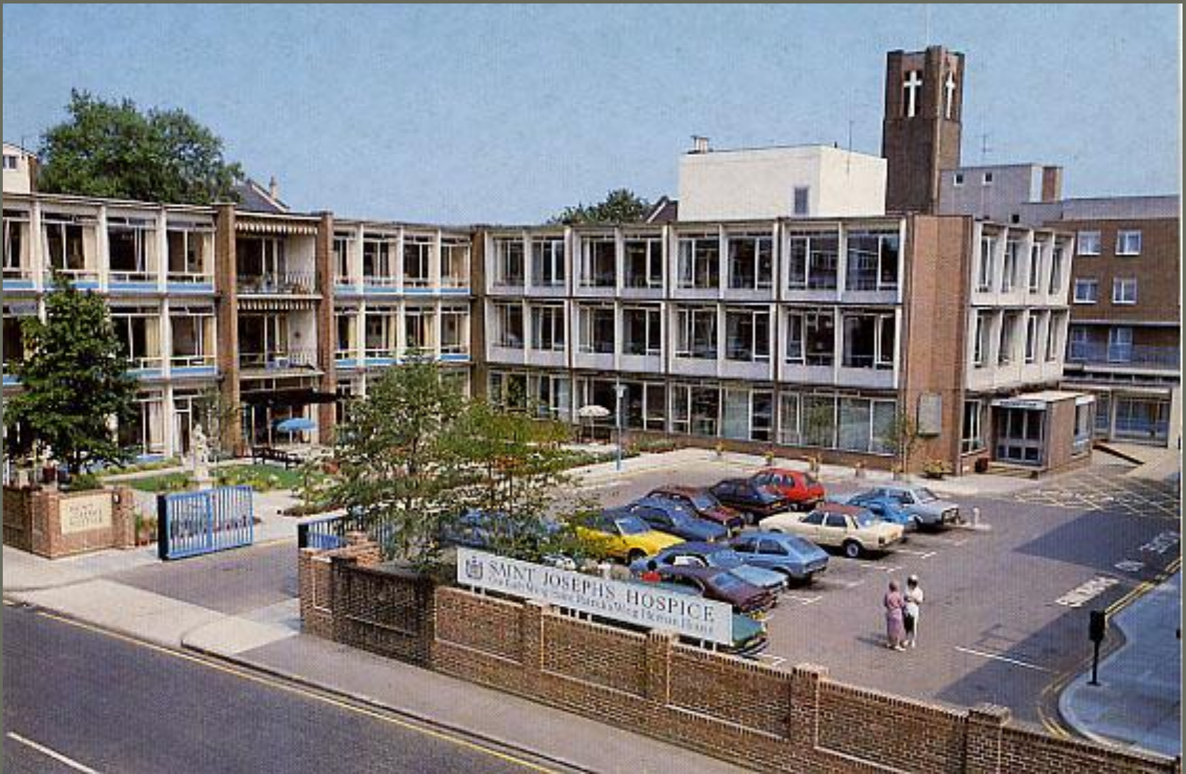
St Joseph's Hospice, Hackney: Stewart, Hendry & Smith