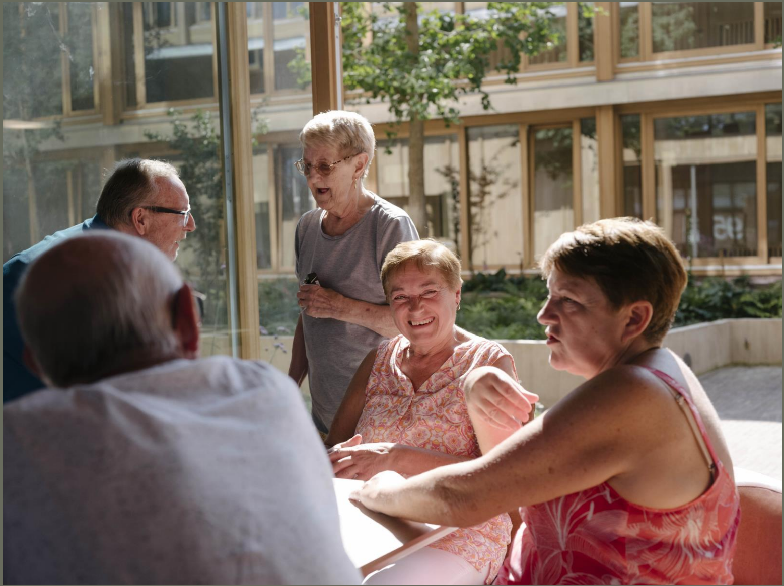
Appleby Blue Almshouse: Witherford Watson Mann