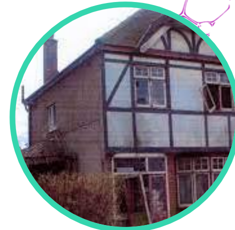
London Rebuilding Society

Homes for Living – Service providing attractive and affordable home adaptations to enable people to age in place for longer