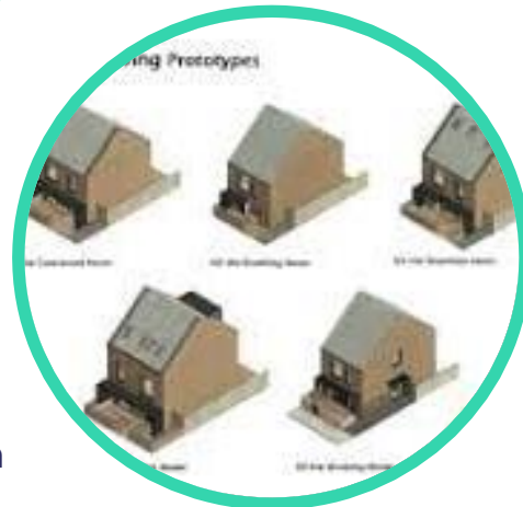
Flexible Living to Age in Place Catalyst

Designing homes for healthy cognitive ageing by identifying scalable and sustainable design improvements to homes