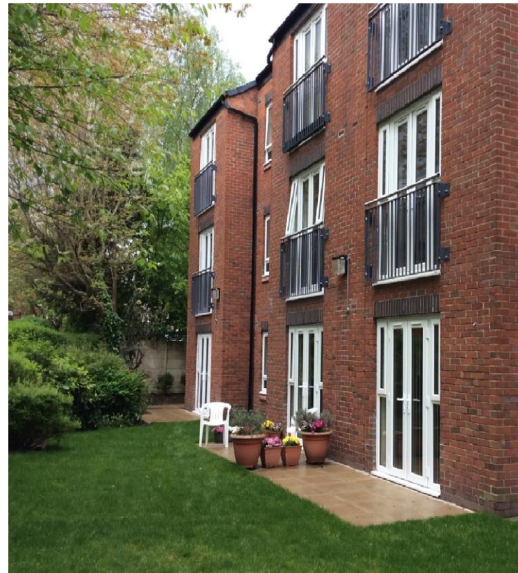
Holland Court - refurbishment