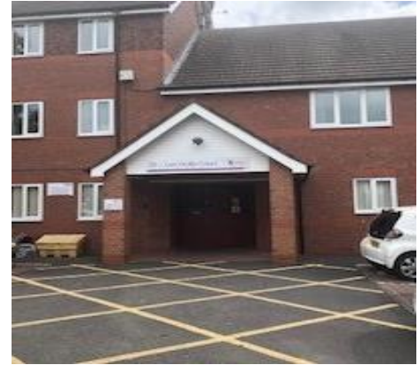
Len Hollis Court