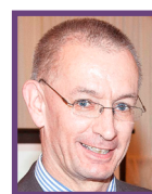
Andy Chaplin Foundations