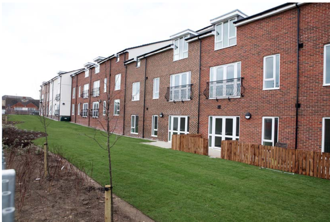
Example of gated dog run for Guide dog

Natural materials assist way finding, divide spaces, highlight level changes and help create a warm and less clinical environment. Callers can be recognised – via clear glazing beside the door, a door view, audible caller recognition or door entry system. Letter boxes should be centred within the door with a 'letter cage' on the inside and door numbers centred at eye level.