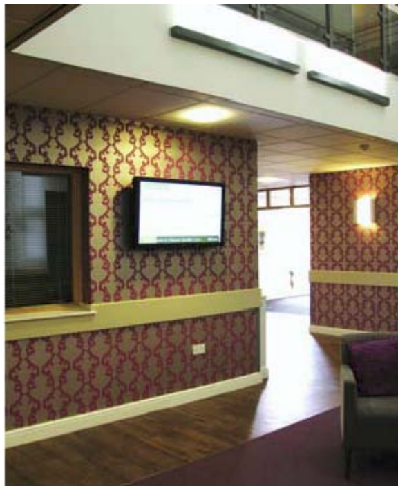
Electronic notice board, Bramble Court, South Shields - Hanover

The use of an electronic notice board can be advantageous in communal areas by providing the information in an easy and accessible way, while minimising unsightly notice boards and posters.