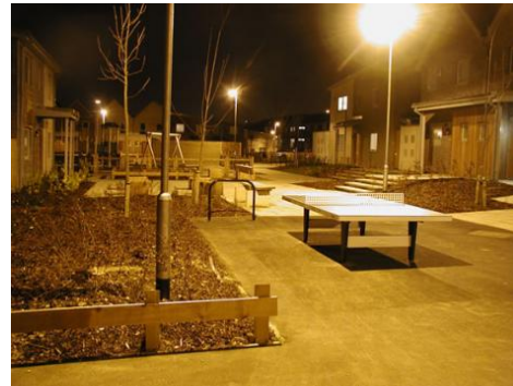
Outdoor table tennis and social space day and night - The Staiths at Gateshead