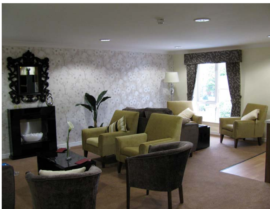
Bramble Hollow, Hetton-le-Hole – Resident's lounge

Developing accommodation requires thought around the use of the internal and external spaces including use of the communal spaces; against medical and health issues experienced by the occupants. This will enable the management and maintenance of those areas to be understood, particularly relating to service charges.