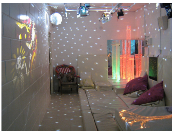
White room :- www.worcestersnoezelen.org.uk

The room in the image above has elements which can be operated by the user from any position in the room through a series of simple switches which provides complete control over the individual's environment.