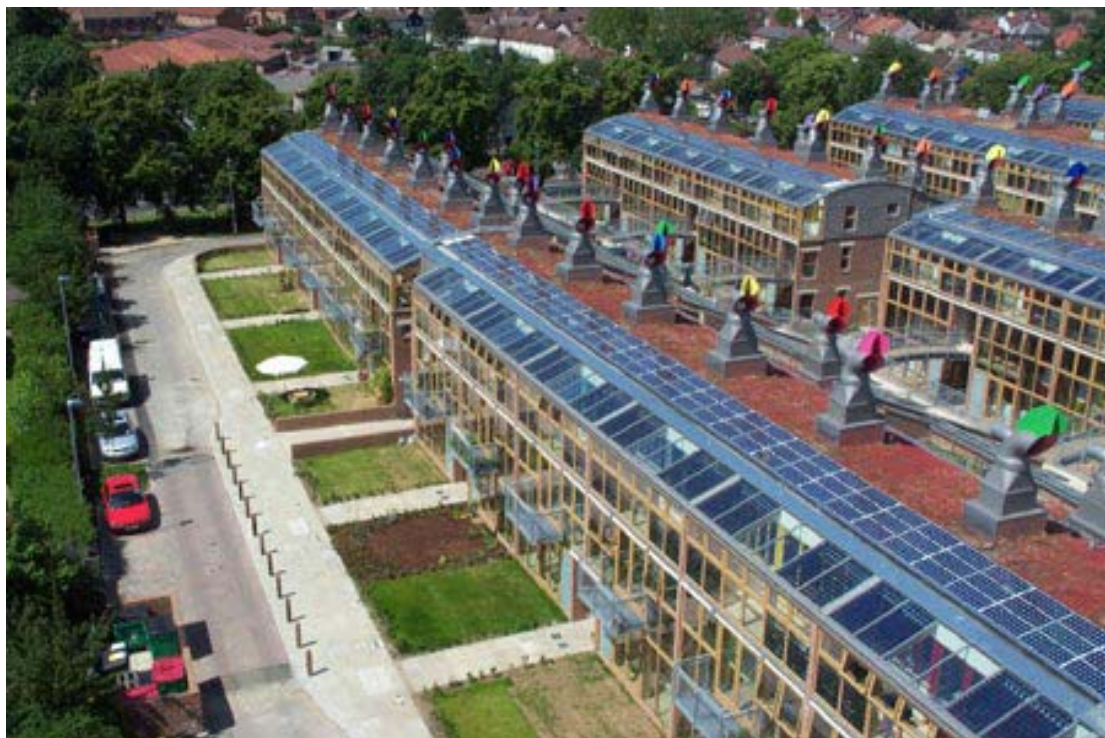
Example of sustainable design - BedZed and Peabody Trust

We expect to see both sustainability and energy conservation embraced within design for new buildings, in particular, the use of natural light, recycling of rain water, high levels of heat conservation, solar panels, heat pumps, ground and air source, and biomass heating along with renewable electricity supply where practicable. In turn we anticipate lower costs for residents in terms of heating charges and service charges due to efficiencies which can be accrued over a period of time due to reaching and surpassing sustainability standards. This will support affordable warmth and help people out of fuel poverty.