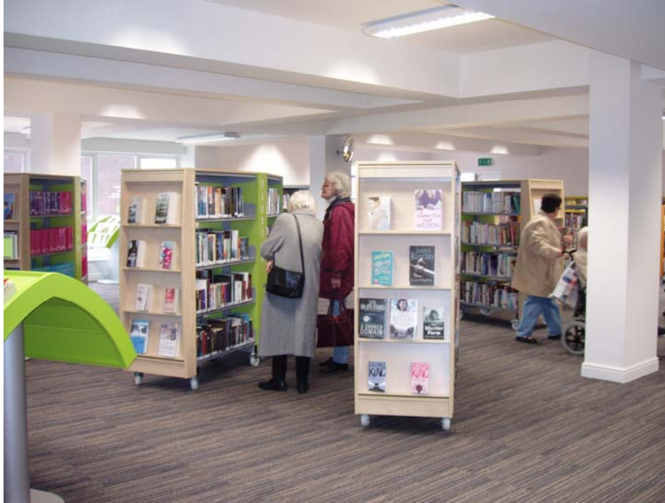
Silksworth Community Library at Beckwith Mews Extra Care Scheme

Quality should not always be costly and can be provided by considering best value; innovative procurement; design, and understanding the people who will be living in; working in, and visiting the accommodation. Embracing value for money principles and being efficient in some areas may enable additional resources to be invested elsewhere.