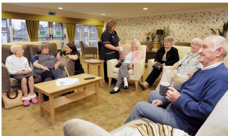
Example lounge area at Woodridge Gardens, Washington – Housing 21

Lounge areas use a large amount of space and the location is important to ensure residents maximise the space. Lounges accommodate a range of activities, each of which generates equipment and artefacts that need to be kept available for use, this may include television; DVD player; CD player, radio, games, books, Wii game, i-pod docking station.