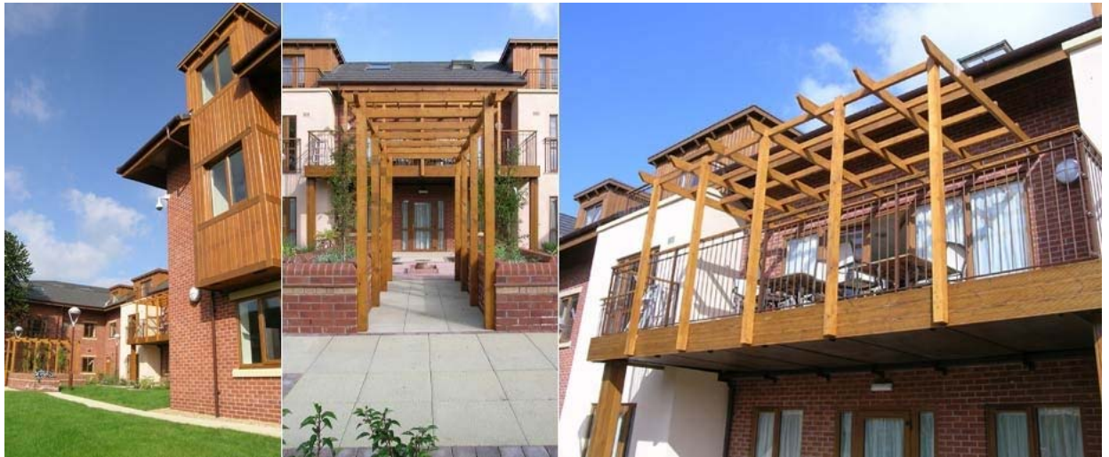
External appearance providing useable and accessible places - Millhouse, Nantwich

A fundamental principle in any building design is that the design should compensate for impairments. An impairment becomes a disability only when the built environment does not compensate for impairments, which could include:-