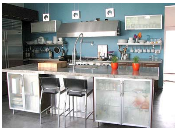
Open plan kitchen idea with glazed units and seating bar

Open shelving is an alternative used in many kitchens. These can be fitted with rails and blunt-ended hooks to hang utensils. A fridge with a glass door entices the person with dementia to eat what is in there. This open, visible approach also makes it easier for care staff to glance in the kitchen and get an idea whether the person is eating well. 6