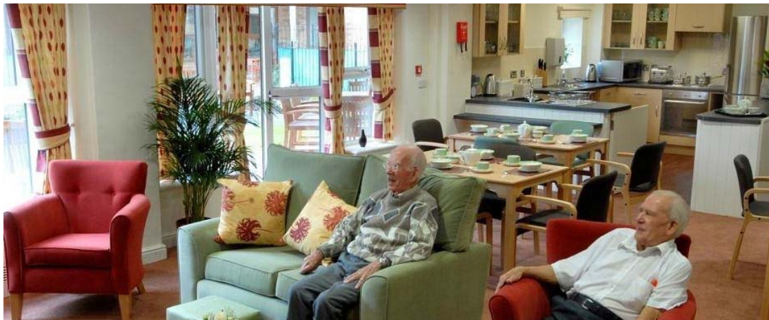
Design without barriers and requirements for signage, Belong, Macclesfield

Many people with dementia like to walk a lot. Design should provide natural and seamless access from inside to outside areas and vice versa, taking into account weather issues, and at the same time allow unobtrusive observation by staff and families. Limit the numbers of doors in communal corridors and to communal rooms to encourage people to have 'free walking experience'. Integrating exercise equipment into internal and external spaces, can help to eradicate excessive energy, which suggests that the need to wander can be reduced and it can also help to increase appetite.