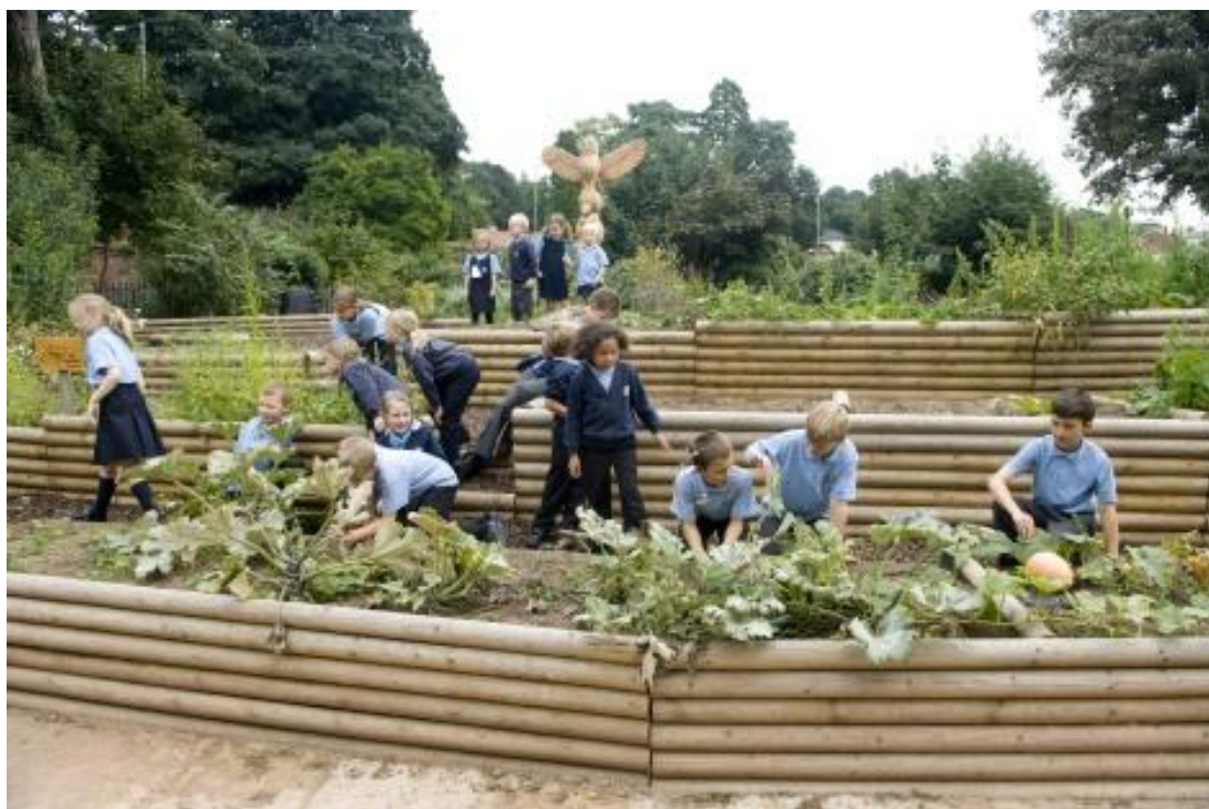
Provision of a vegetable garden area at Redhill Primary School - Worcester