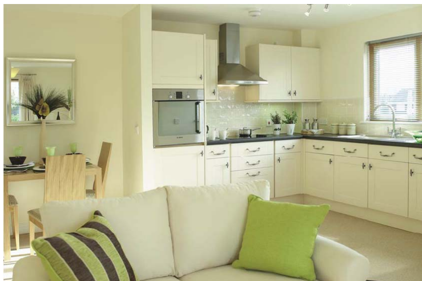
Example living area at Barton Mews, Staffordshire

Every design for new supported accommodation must focus on the quality of the spaces created, establishing the sense that this is a pleasurable place to live in, which will adapt to, rather than constrain the changing needs of a household. The HAPPI report outlines the open plan approach to older persons living – this approach can support an apartment to be flexible and 'care ready' utilising the provision of sliding doors and removing barriers within the apartment space.