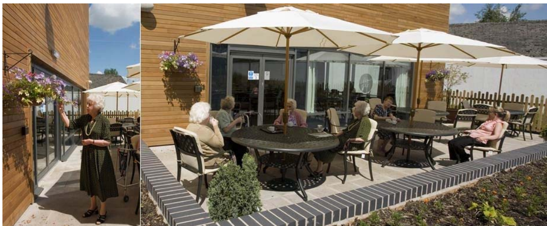
Outside eating area, providing al fresco dining - Belong, Wigan

Where space is available the restaurant should be clearly linked to an outside patio space to enable the restaurant to be extended outside in warmer weather encouraging 'al fresco' dining. Access doors should not be identified as 'fire exit' doors as this may discourage people from venturing outside.