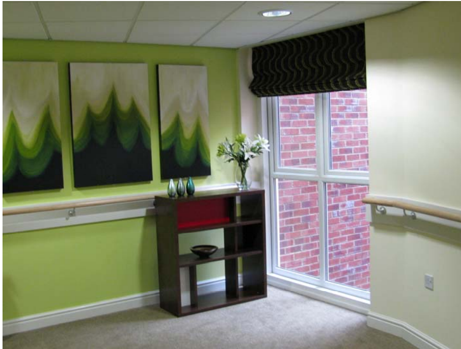
Example of way finding / identifiable zones at Bramble Hollow, Hetton le Hole