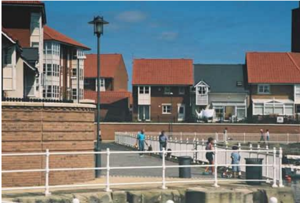
Roker Marina, Sunderland