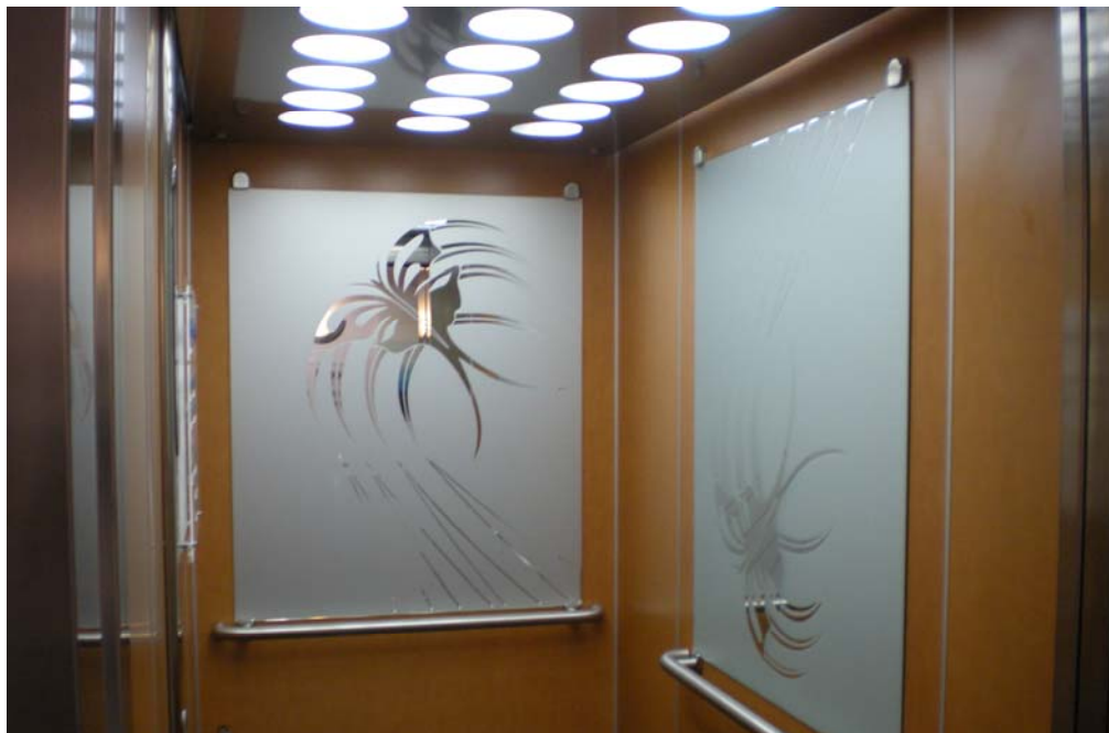
Manifestations in lift at Woodridge Gardens extra care scheme , Washington

Normally two lifts are provided in case of breakdown with one wheelchair lift whilst the other needs to be a stretcher lift. Emergency call buttons must be available near the ground floor of the lift to enable someone to push this if they fall in the lift and are unable to reach the emergency call panel which is usually provided on the wall of the lift.