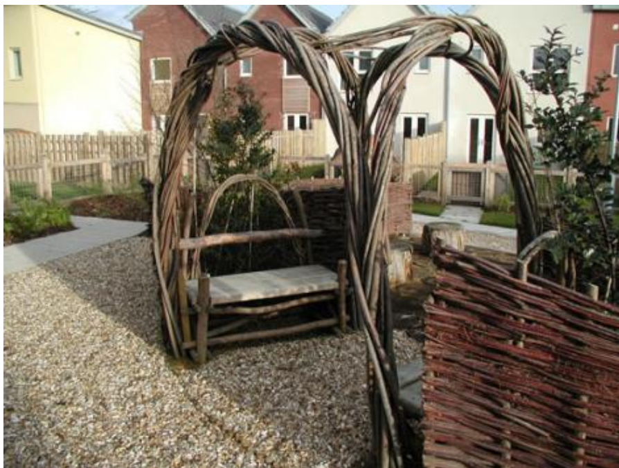
Seating areas giving private but attractive space – The Staiths at Gateshead

Giving consideration to the residents living at the accommodation, garden areas should be functional, useful and safe external spaces which can provide areas for relaxation; socialising; activities and private space. The benefits of green space have a direct effect on quality of life in terms of both physical and mental wellbeing.