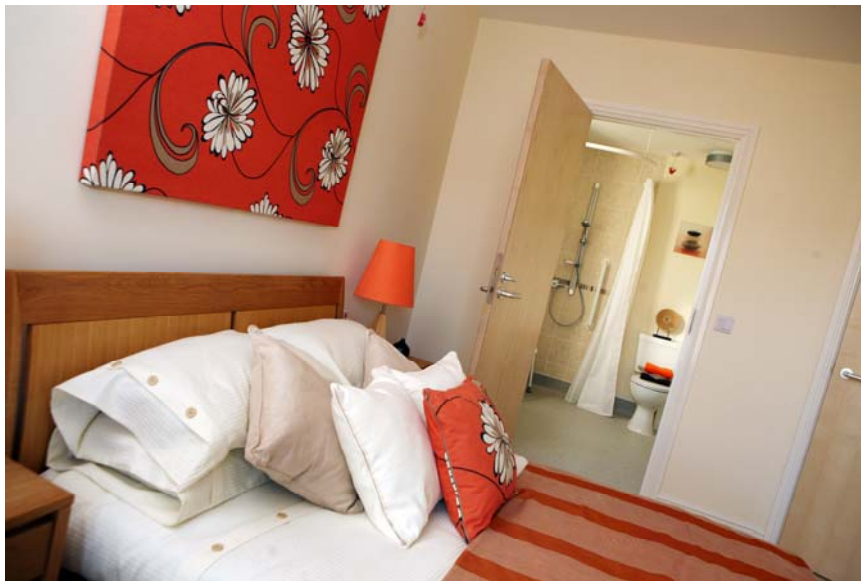
Clear visibility into bathroom from the main bedroom – Woodridge Gardens, Washington, Sunderland

Toilet doors should always be highly visible with contrast and the WC visible from the bed. A connecting door between the main bedroom and shower room provides the en suite accessibility, but providing a door from the hallway into the shower room provides a more 'traditional' layout which should provide easy access for the resident.