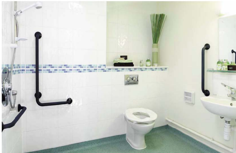
Example bathroom provision at Barton Mews, Staffordshire

In larger family bathrooms consideration must be given to:-