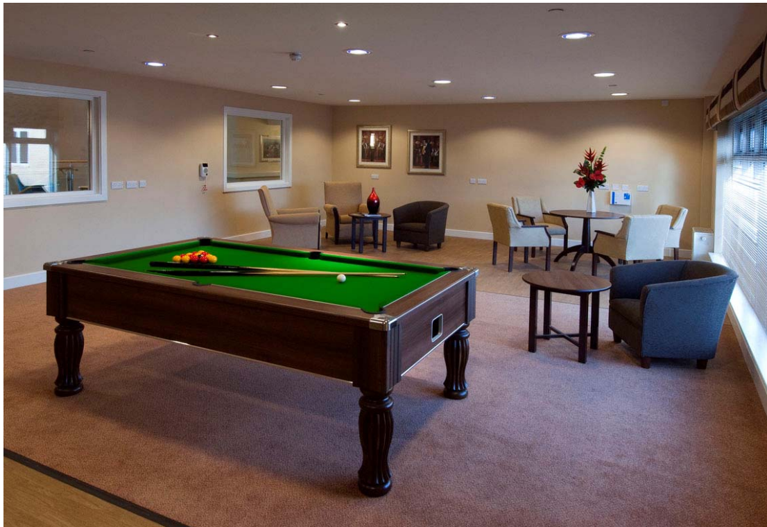
Activity / Games Room

The quality of our resident's lives must be enhanced in the homes they have available to them now, and to ensure that the accommodation is future proofed to meet the needs and expectations of residents into the future. This includes providing a mix of tenure so people can choose how they want to live based on their finance availability and preferences.