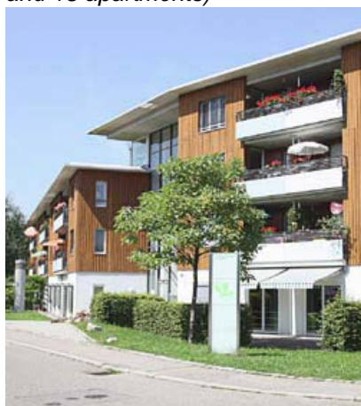
Gradmann Haus apartments for partners to the scheme

Drawing shows rooms for people with dementia in green with the right hand side block and block along the front for carers / partners to live in, independently. (25 rooms for dementia and 18 apartments)