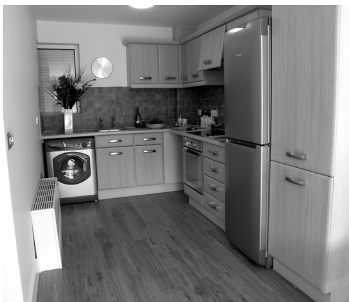
Open and accessible kitchen allows everyday tasks to be undertaken easily at Millhouse, Nantwich, Cheshire

Provide a white board or cork board on the wall to record important numbers; tasks for the day; record of visits to be made during the day by care and support / friends / family.