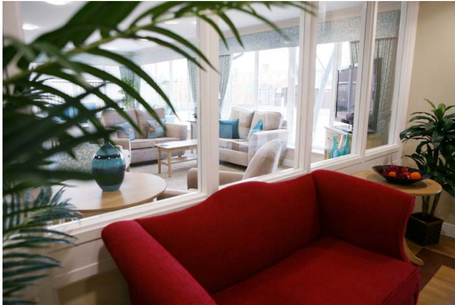
Seating area, Beckwith Mews, Silksworth