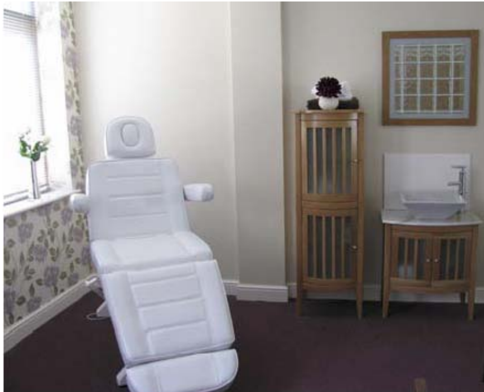
Pamper Room at Bramble Court, South Shields - Hanover

At least a therapy chair must be provided which easily converts from a treatment chair into a strong and stable couch allowing transition from a seated to a lying position. Such an item would usually provide an electronic lift and power-assisted section. Information outlined earlier should be considered to enhance the 'spa appearance and experience' of this room