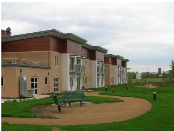
Llys Eleanor Extra Care – Flintshire County Council

Llys Eleanor Extra Care Scheme has a wealth of state of the art features including 'intelligent' sprinkler system and telecare/assistive technology to aid daily living. Environmental features include rain water harvesting linked to wc facilities and allotments in pleasant extensive grounds.