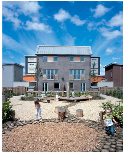
Alternative use of outside space – The Staiths Development, Gateshead

With a flat green area provided in communal garden areas older people can be encouraged to take part in fun activities.