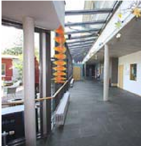
Gradmann Haus, Stuttgart, Germany – natural day light encourage in communal walkways with clear access to the outside area

Design of stimulating activities must be prioritised within the building both in terms of the structure of the building; the finishes and the actual activities provided within the scheme.