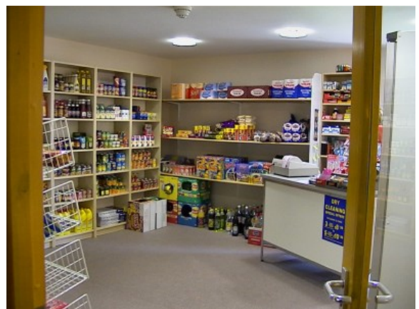
Winton Court Extra Care Scheme, Gateshead – local shop