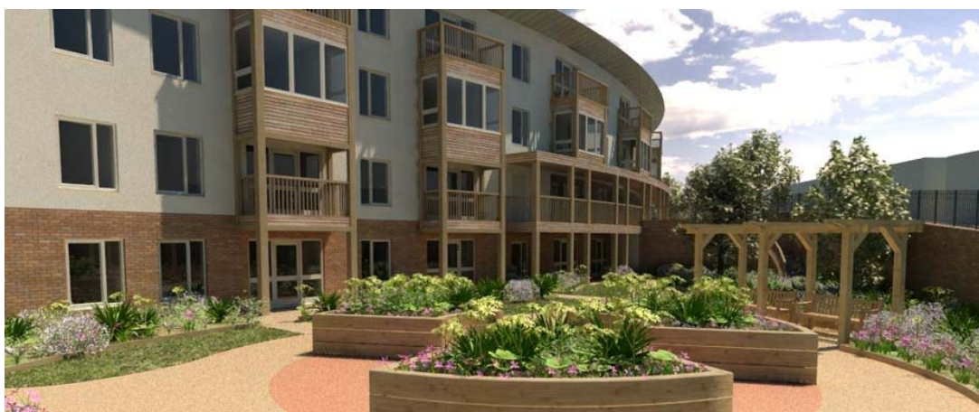
Clear circulation routes and seating areas with raised flower beds – Ravensfield, Dukinfield