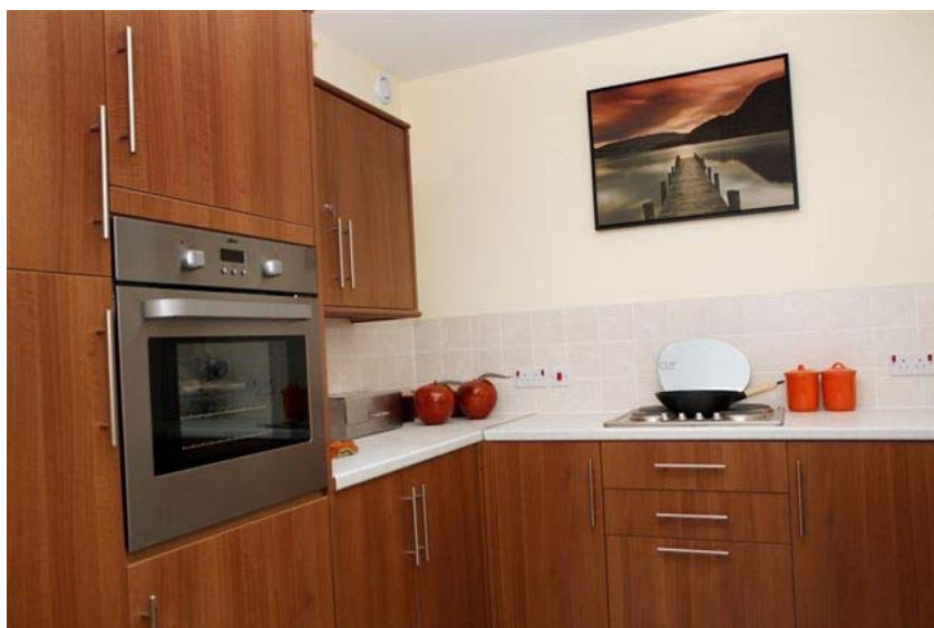
Kitchen with accessible oven and hob with front controls

Integrated cookers and hobs are usually provided as part of the fit out of the kitchen areas. The cookers should provide an easy opening door. Side opening oven doors can help people to access the oven and its contents easily, putting cooked food straight onto the bench areas.