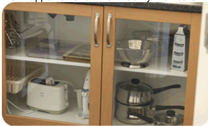
An example of clear glazed kitchen units

Eating and drinking is always important, but a person with dementia may lose their appetite and their ability to care for themselves in this way.