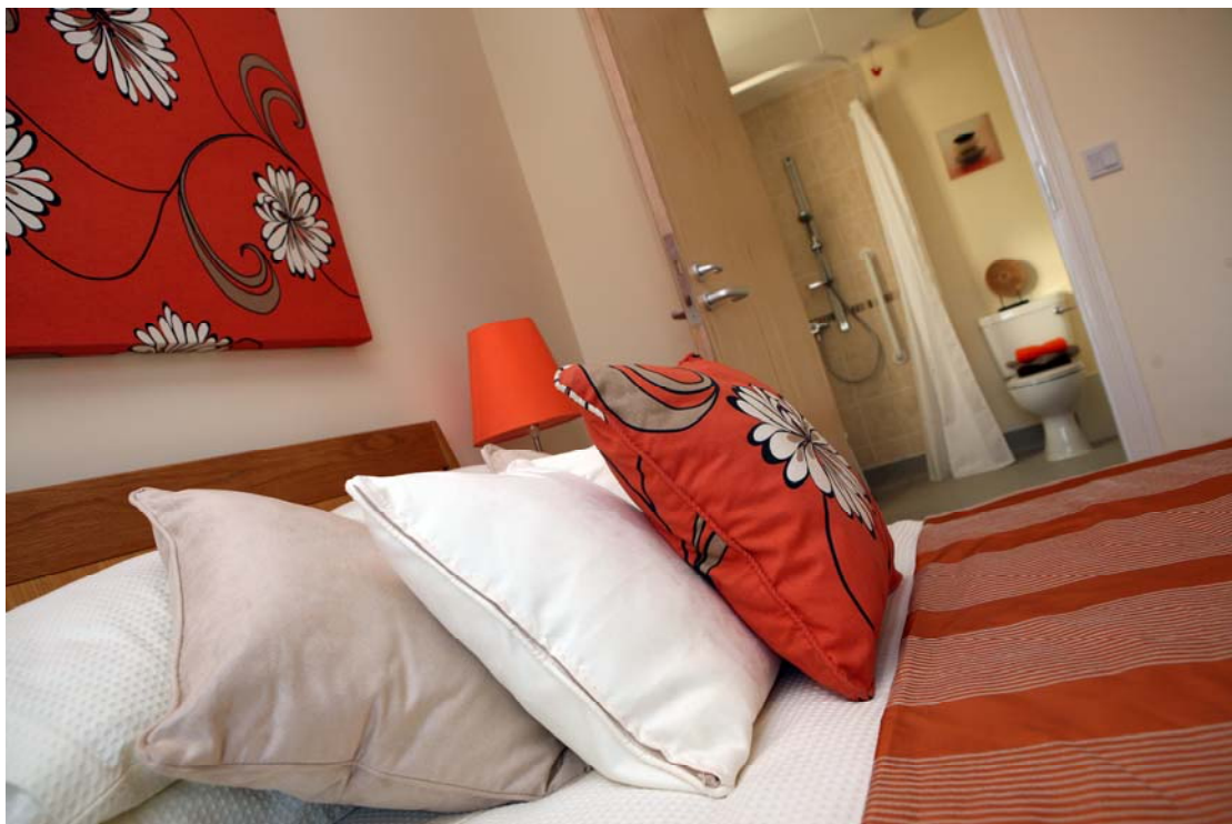
Bedroom into bathroom / walk in shower at Woodridge Gardens, Washington

A bedroom must provide for sleep and relaxation with safe movement and adequate space for storage. The bathroom should be linked directly to the bedroom to enable easy access for those with poor mobility. Windows must be easily accessible and easy to open giving consideration to people with mobility, disability and dexterity problems. Ventilation must be achieved while maintaining home security / safety.