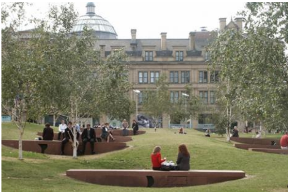
Example seating and environmental design

Pergolas covered in climbing plants can provide shading for south facing terraces or to shade seating areas. Water features can support a stimulating and tactile environment and provide effective focal points.