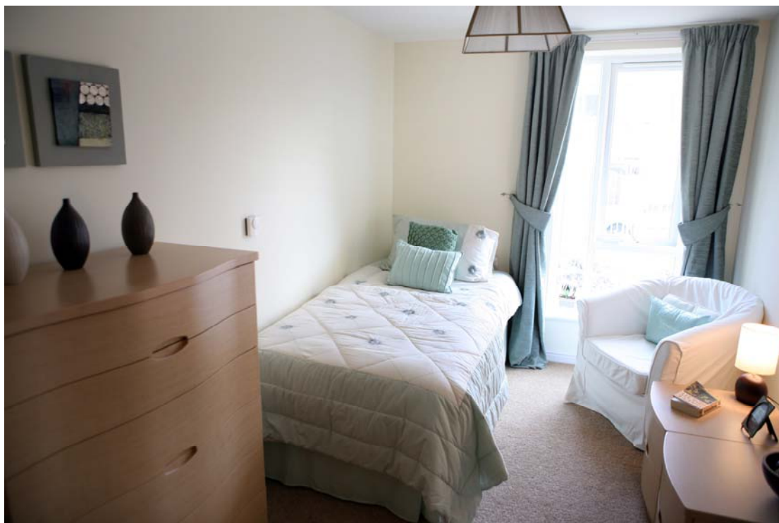
Second bedroom provision at Beckwith Mews, Silksworth

Evidence shows that a second bedroom is a high priority for residents. It can provide for couples who choose to have their own rooms, often caused due to a medical issue; provision for caring arrangements /sleepover provision; spare room for family and friends; enables older people to continue to have grandchildren sleeping over. A third habitable room in housing for older people is now an HCA expectation.