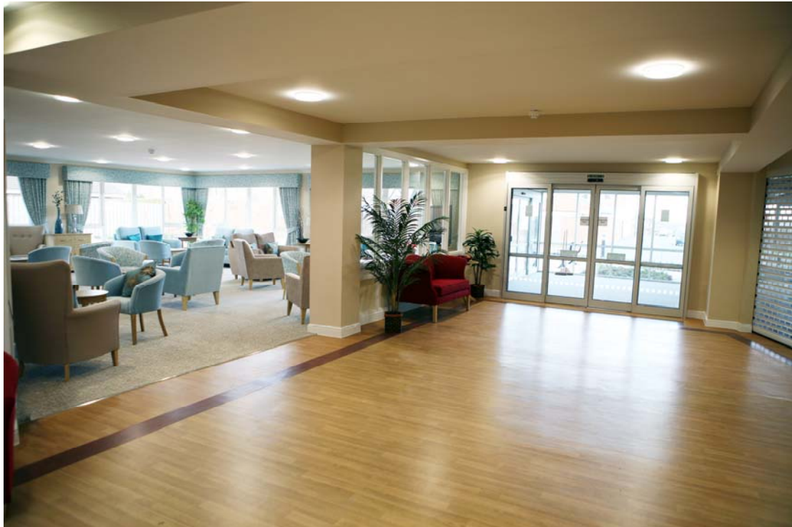
Entrance, main foyer and lounge with library access to the right – Beckwith Mews, Silksworth

Small seating bays can break up walking distances and provide a ‘rest stop’, however, this should be discussed with Fire Officers to ensure that they are confident and in agreement with the proposal.