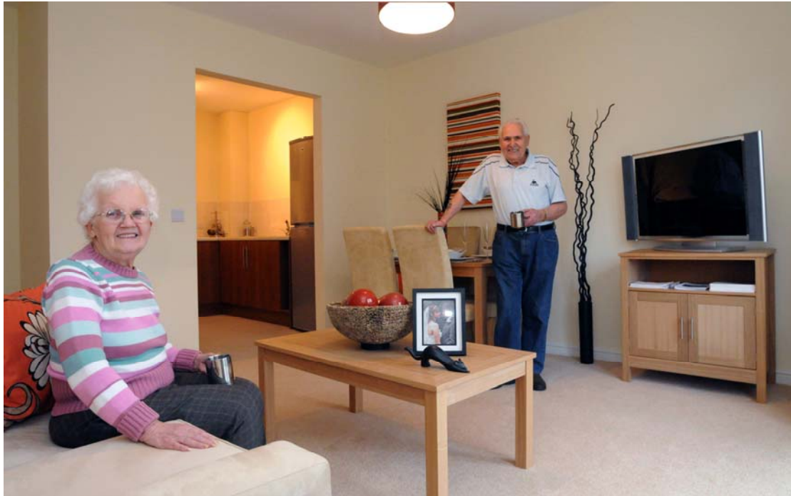
Sitting room with dining area at Woodridge Gardens, Washington – Housing 21