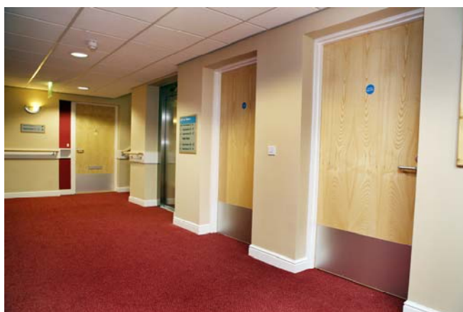
Lift in main entrance – Beckwith Mews, Silksworth – Housing 21

Lifts should be located adjacent to central facilities and have a clear 'waiting' space in front of them. If the lifts are intended to be used for evacuation they will require a lobby, ideally with hold open devices.