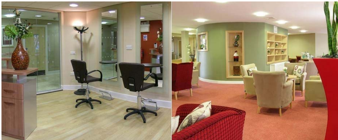
Open plan communal areas at Millhouse, Nantwich, Cheshire, helps residents to see different uses and spaces

The combination of cognitive and visual impairment is likely to be an overwhelming experience, profoundly affecting functional ability, activity, mood and sense of identity. Research suggests that individuals with dementia and sight loss may experience a profound sense of disorientation and may be highly vulnerable to isolation. There is also a destructive effect on an individual's ability to enjoy hobbies and interests. For example, the combination of poor sight, poor concentration and poor memory restricts older adults' ability to read, and cognitive difficulties prevent them from learning how to use alternatives such as audio books. It is important to provide this client group with corrective remedies for sight loss, a 'user-friendly' environment, optimal lighting, colour and contrast, assistive technology, clear verbal instructions, one-to-one contact and opportunities for interaction and activity.