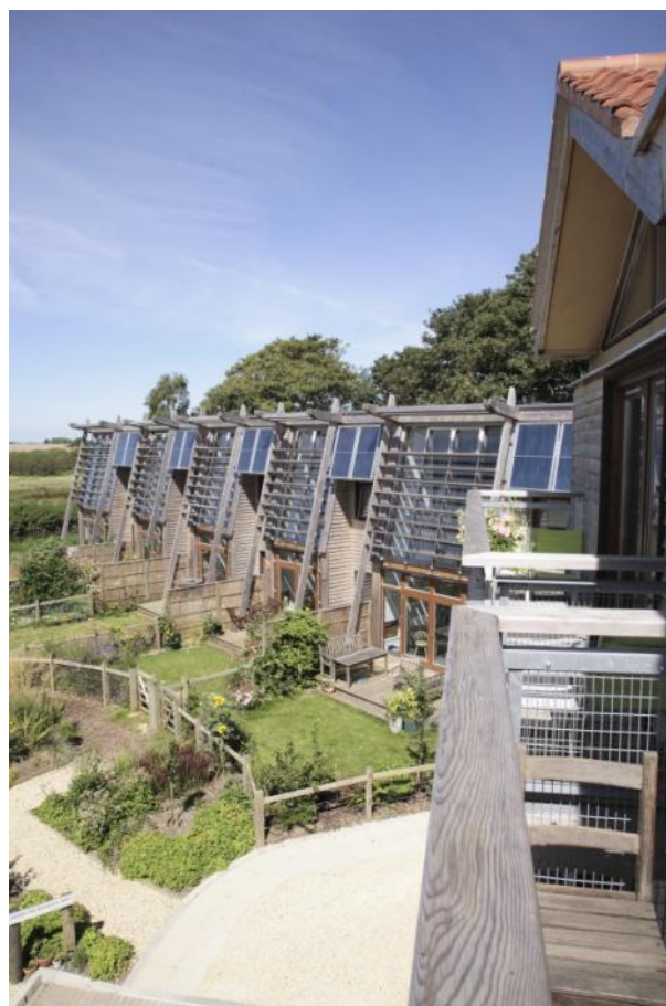
Eco Homes Scheme, Great Bow Yard, Somerset demonstrating sustainable construction.