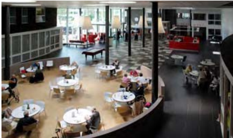
Open Plan communal and restaurant area – Maaternshoff Care Community – Holland

Restaurant areas are usually located in the main foyer of the scheme. The restaurant size should be adequate to cater for residents, staff and visitors and provide an adequate kitchen area; storage provision; changing area and office space. Kitchen areas require effective ventilation to maintain a comfortable and safe working area for staff. The use of CCTV and telecare speech units should be considered (as appropriate) in the restaurant area, to facilitate the safety of residents and staff.