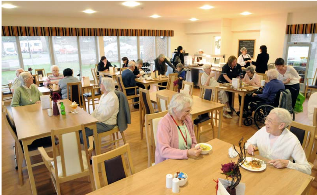
Restaurant area at Woodridge Gardens Extra Care Scheme, Washington – Housing 21

Communal areas are central to serve all residents. Some have been developed in clusters or friendship groups with 8 or 10 flats having an individual lounge and dining room. This must be decided at first stage of the design process.