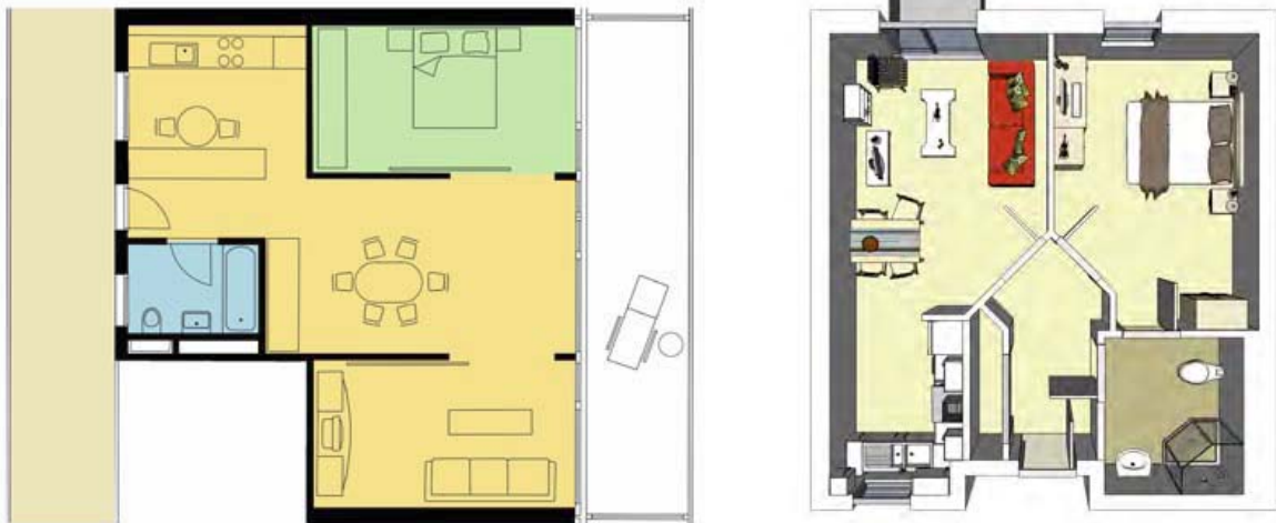
Example open plan living area (left) and traditional cellular apartment (right) – HAPPI report

Good natural lighting should be maximised in the apartment. Low light levels reduce the ability to read, lip read and increases the risks of falls and it is not suitable for people with visual impairment. An extension to the sitting room, providing a ‘sun room’ can provide a warm and practical area for people to sit and / or eat in the warm area, but with the feeling that they are outside due to the floor to ceiling glass structure. Hanover have designed this into their extra care schemes and the provision has been received very positively by residents, giving an interesting feature to apartments especially where the apartment may not have a particularly good outlook. Alternatively, a balcony can provide useful external space.