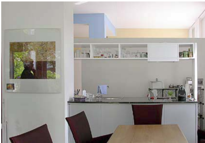
Flexible open plan kitchen and dining area - Solinsieme – St Gallen,