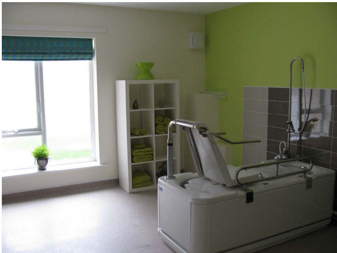
Assisted bathing suite – Bramble Hollow, Hetton le Hole – Housing 21

The bathing and healthy living suites should be decorated in such a way to promote a 'spa' appearance rather than a clinical appearance. The use of plants and domestic furnishing can give these areas a comfortable and relaxing feel alongside providing light dimming facility; atmospheric music; and aromatherapy being piped into the room. Consideration can be given to combining both provisions into one area to maximise the use of the space and keep service charges to a minimum. Providing a shower curtain and rail around the bath or a retractable screen can provide a more relaxing and informal bathing experience for the bather; or can screen off the bathing area when not in use, for those receiving treatments, if the room provides for both.