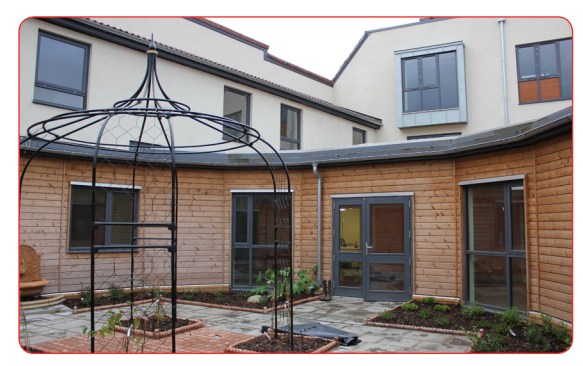
Saffron Gardens, Bristol

Pat Palmer reports the official opening of Saffron Gardens, Brunelcare's £7m new Centre of Excellence for Dementia Care in Whitehall, Bristol. With a mix of residential care and independent flats on site, along with BrunelCare's head office, Saffron Gardens offers a unique and custom-designed accommodation that supports 48 residents around 4 pleasing courtyards of 12 bedrooms each and 14 units of mixed-tenure accommodation.