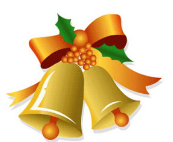
Season's Greetings from all at the Housing LIN!