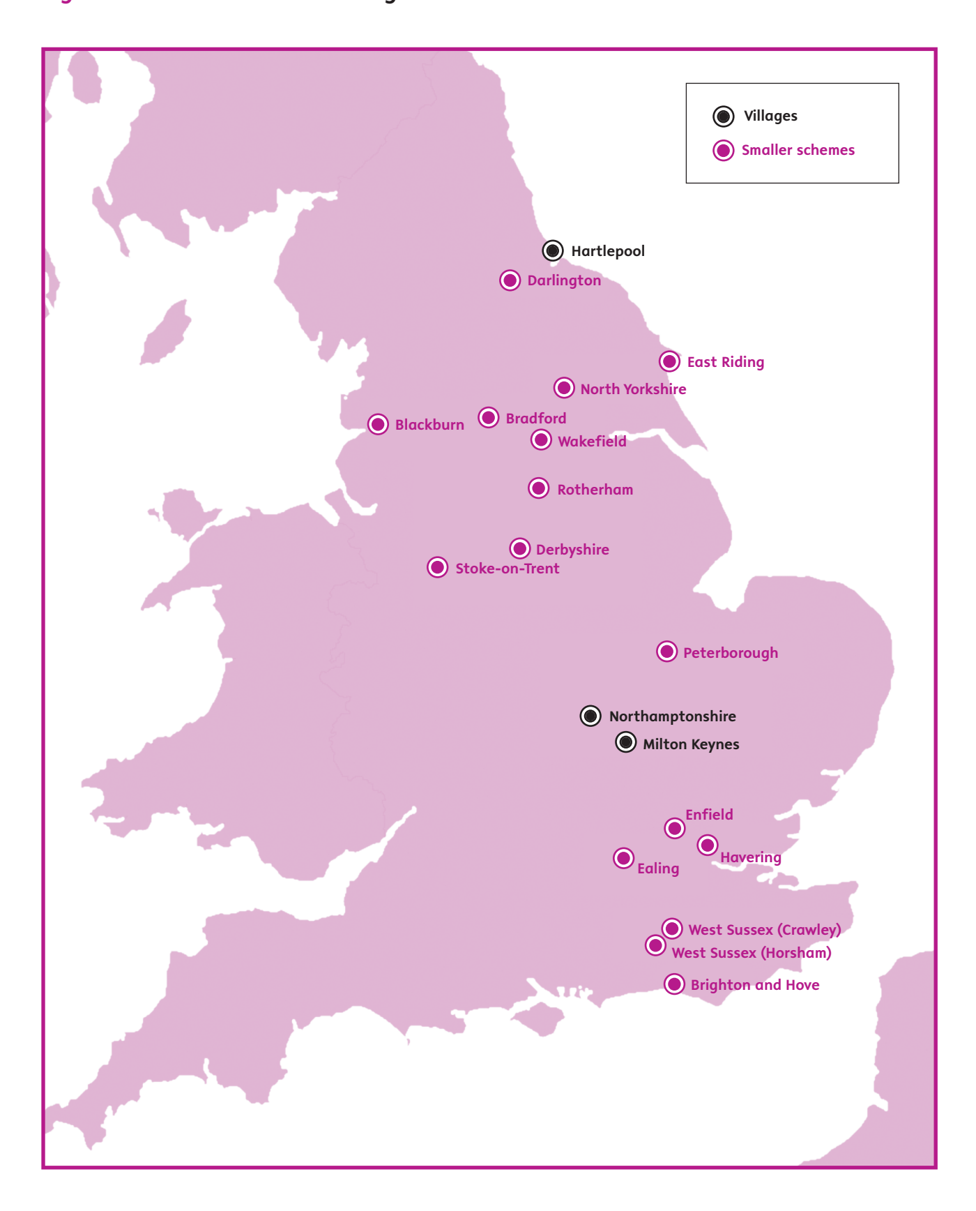
Figure 1: The extra care housing schemes included in the PSSRU evaluation