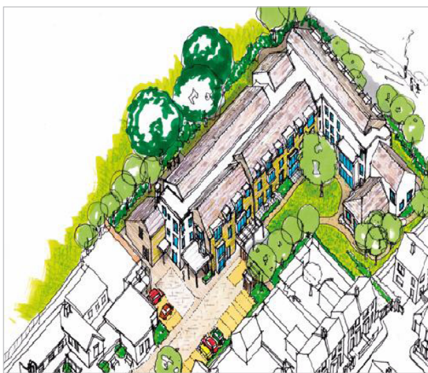
Trailway Court, Blandford Forum

Trailway Court is an affordable, 40 flat ECH scheme, located centrally in the market town of Blandford Forum in the north of the County. It received a £1.75 million capital grant under the Department of Health's 2008-2010 Extra Care Housing Fund programme and officially opened in April 2011.