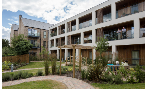
St Bedes, Bedford