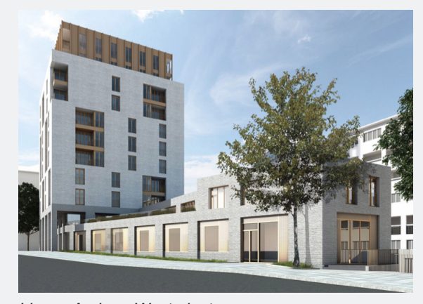
Lisson Arches, Westminster

This scheme creates a mixed tenure Lifetime Neighbourhood, with some of the best views in town, a sense of community, and considerable regeneration benefits for the locality.