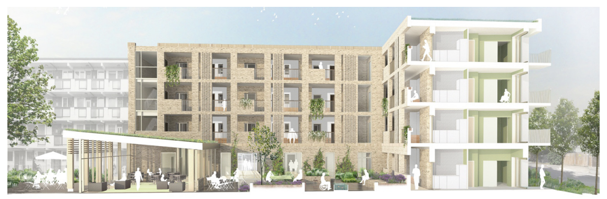
Hazelhurst Court, Lewisham

A similar layout has been proposed for two extra-care schemes in Lewisham - Hazelhurst Court in Beckenham, by Levitt Bernstein Architects for Phoenix Community Housing; and Campshill Road by PRP for the council. In Campshill Road, the communal core is a homezone mews street flanking an E-shaped building whose wings enclose private courtyards.