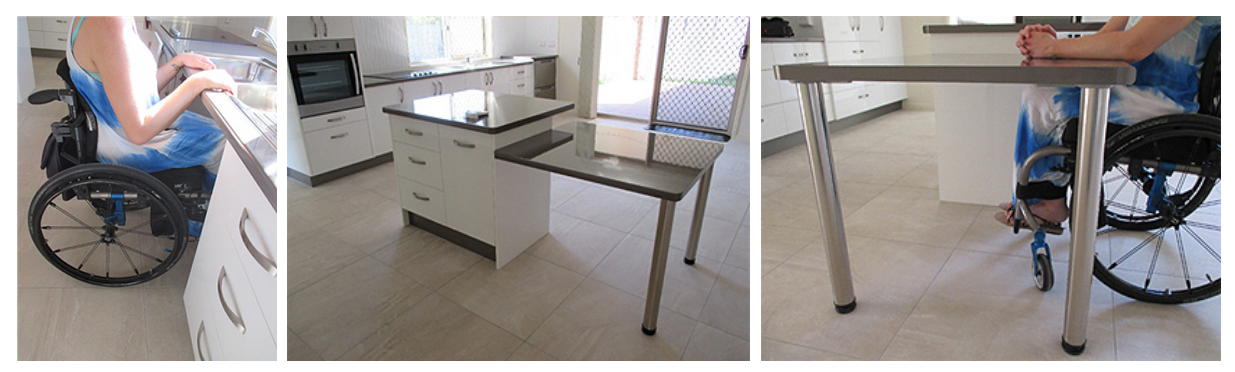
Kitchen modifications for wheelchair users

Home modifications include small items such as grab-rails that can be installed at low cost, or larger renovations that are expensive, such as the addition of new areas to homes or the remodelling of bathrooms, kitchens and bedrooms, and the installation of ramps and lifts. Occupational therapists understand the importance of people remaining in their own home and actively engaging in valued roles and meaningful occupations. Their understanding of the impact of disability on individuals and households, in particular informal carers, enables them to work collaboratively with people to remove environmental barriers, and propose layouts and design features such as home modifications, for enabling home environments. Occupational therapists play a valuable role in partnering with design and construction professionals to determine the most cost effective and homelike, elegant and appealing solutions that are usable, safe and less noticeable than specialised options (Ainsworth & de Jonge, 2014).