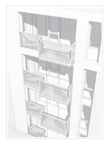
Hanover wintergardens to front elevation