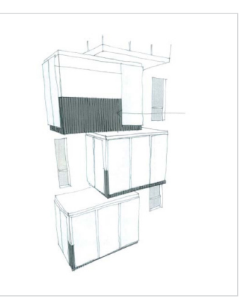
Hanover balcony concept