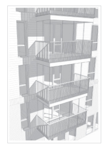
Hanover wintergardens to rear elevation

At the far end of the building, balconies become enclosed winter gardens to allow the older Hanover residents to benefit from year round enjoyment, extra living space and lower fuel bills. These can be completely closed, providing a protected conservatory-like space in colder weather, or opened up with sliding glass panels providing more of an open balcony on warmer days.