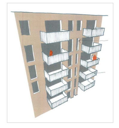
Hill balcony concept

Closer inspection reveals subtle changes along the length of the facade, particularly in the treatment of the private outdoor space. These variations are a direct response to the practical and cultural requirements of the different client briefs. Simply stacked balconies to the private sale flats give way to a staggered arrangement to the AIHA homes in the middle of the block. This is a deliberate shift designed to ensure that each of these balconies will have a view of the open sky allowing the Jewish Orthodox residents to observe and celebrate the festival of Sukkot.