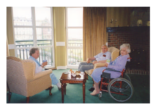
The Marlborough: lounge