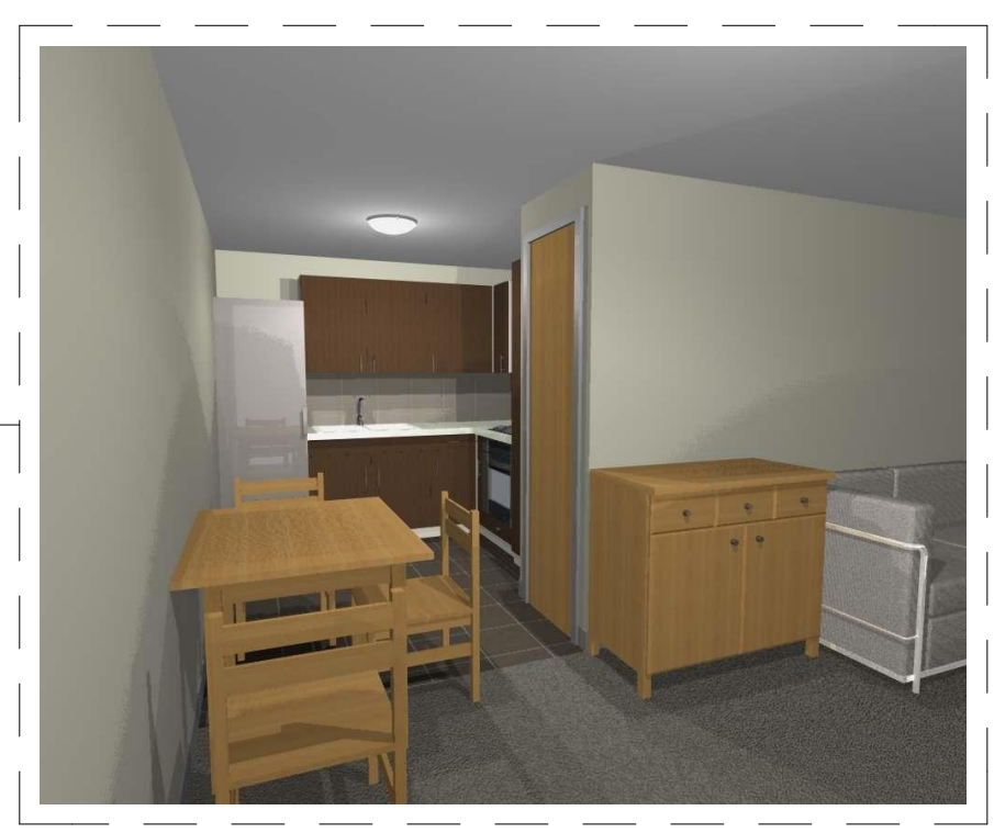
Open Plan Kitchen Typical Converted Unit:

Rev. B 05/03/14 Flat layouts revised following client sign off and 3d kitchen and bathroom perspectives added.