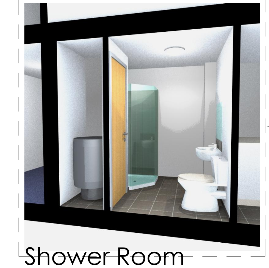
Typical Small 1 Bed Unit: