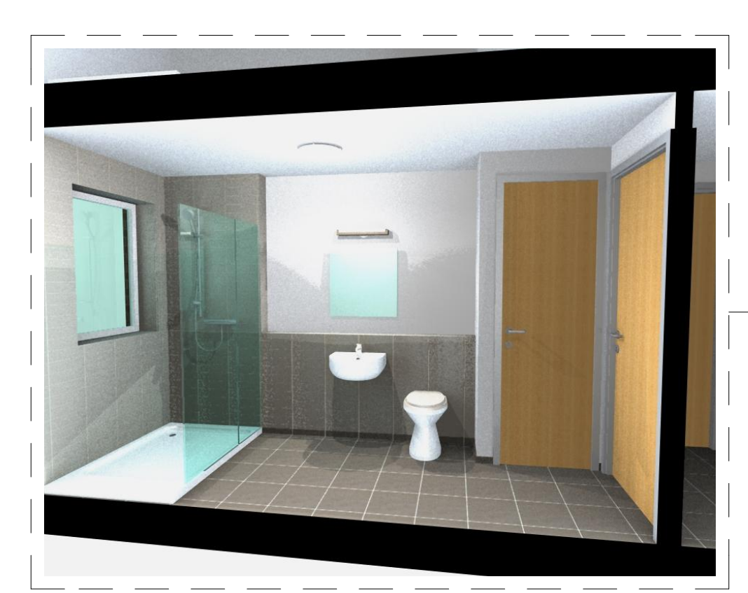
Shower Room Typical Converted Unit: