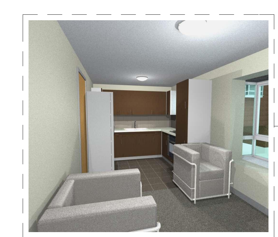
Open Plan Kitchen Typical Small 1 Bed Unit: