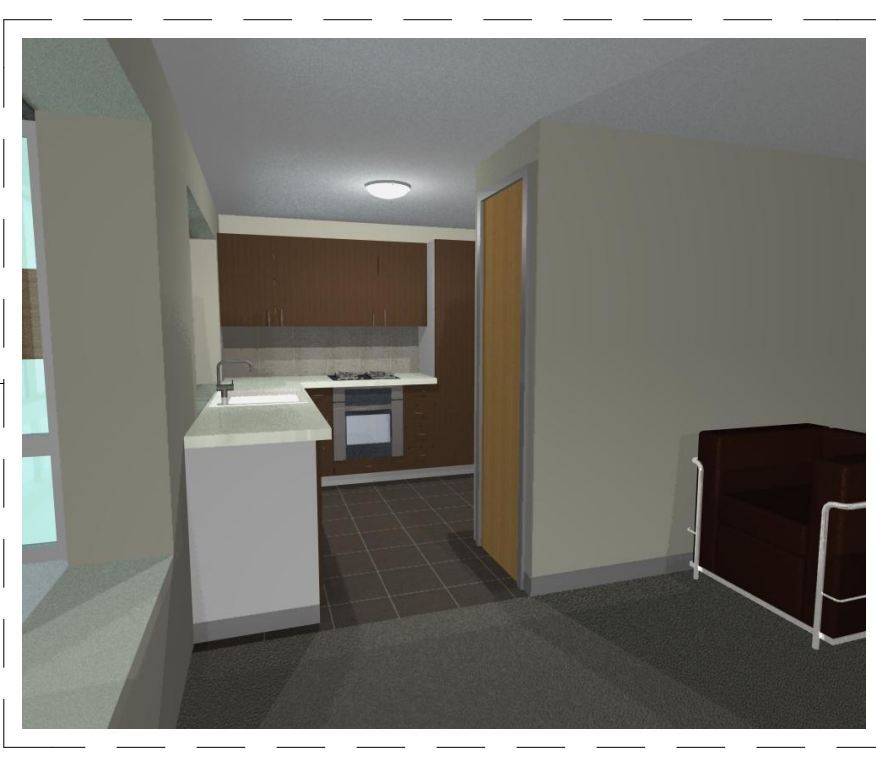
Open Plan Kitchen Typical Converted Unit: