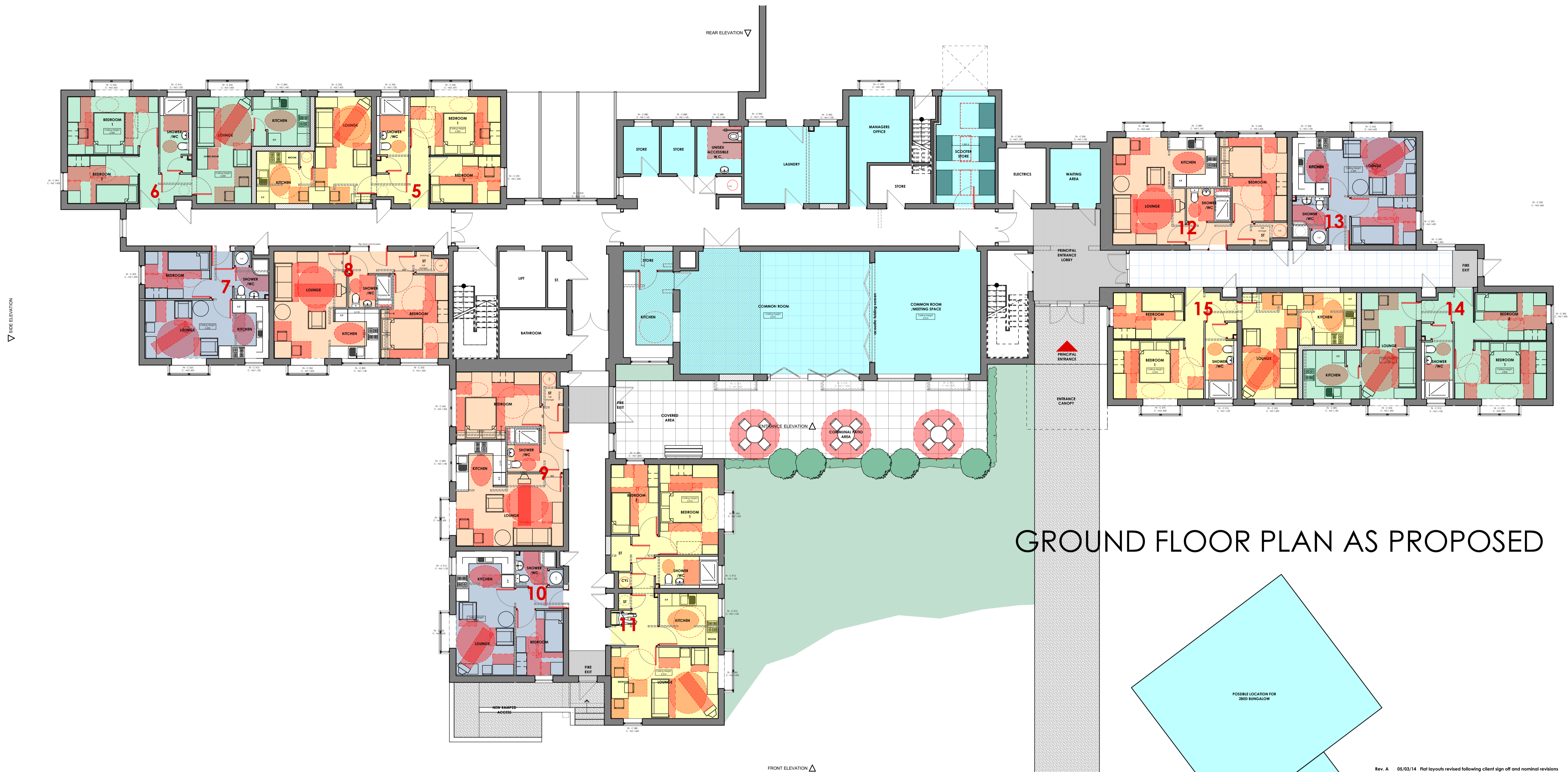
GROUND FLOOR PLAN AS PROPOSED