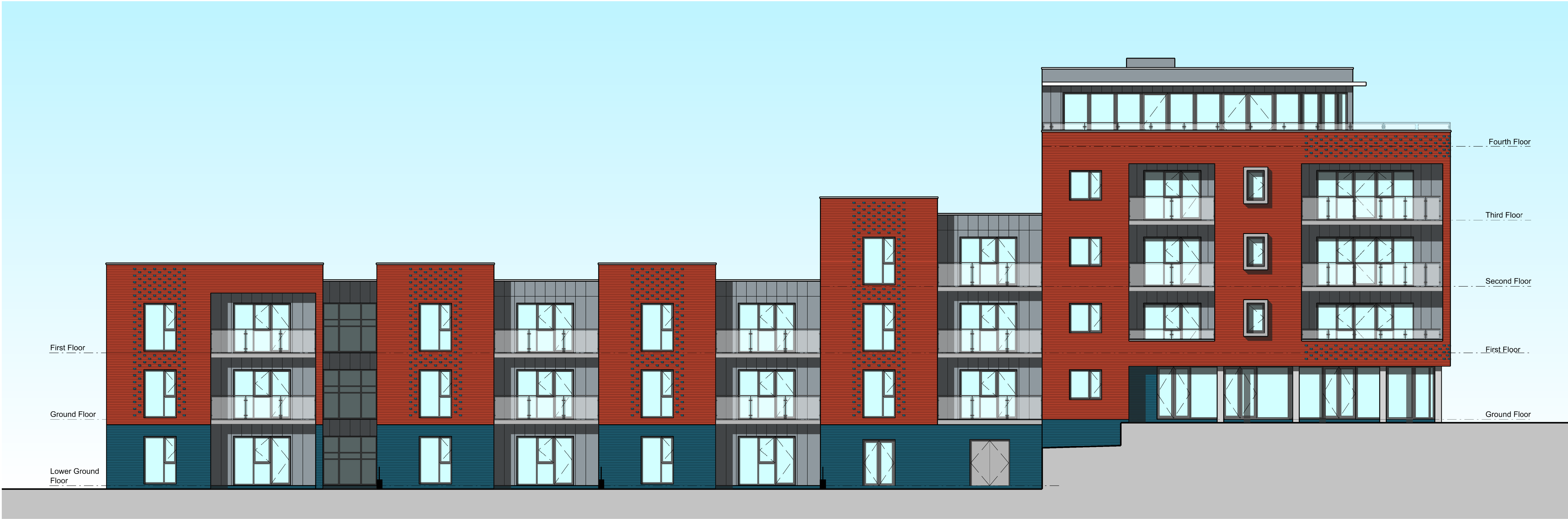
South Elevation (facing new park)