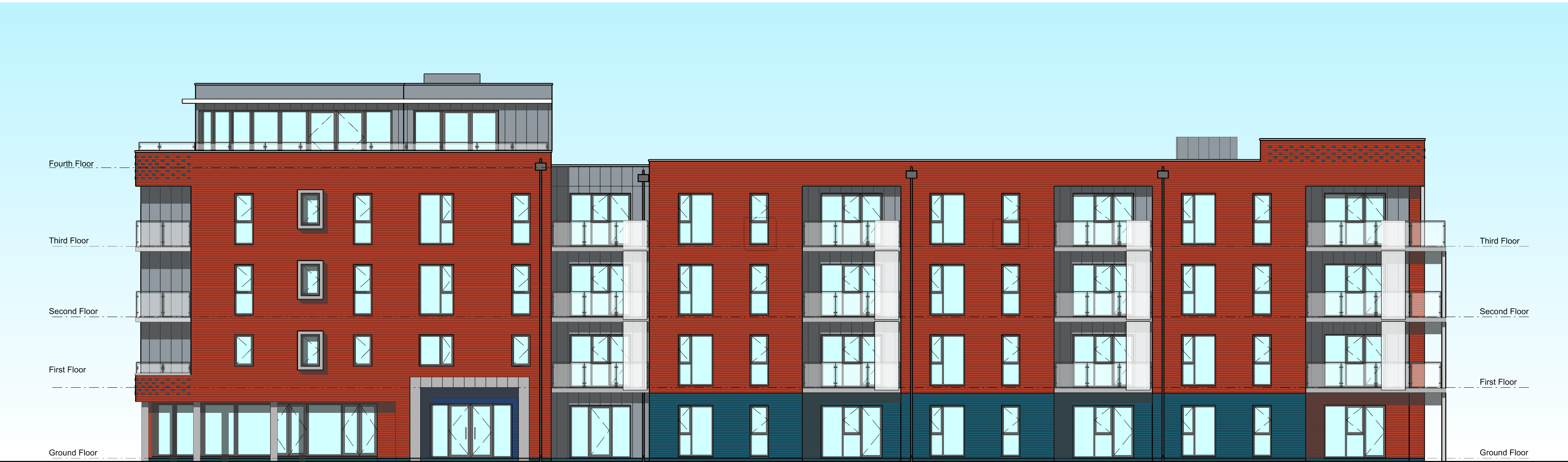
East Elevation (along new road)