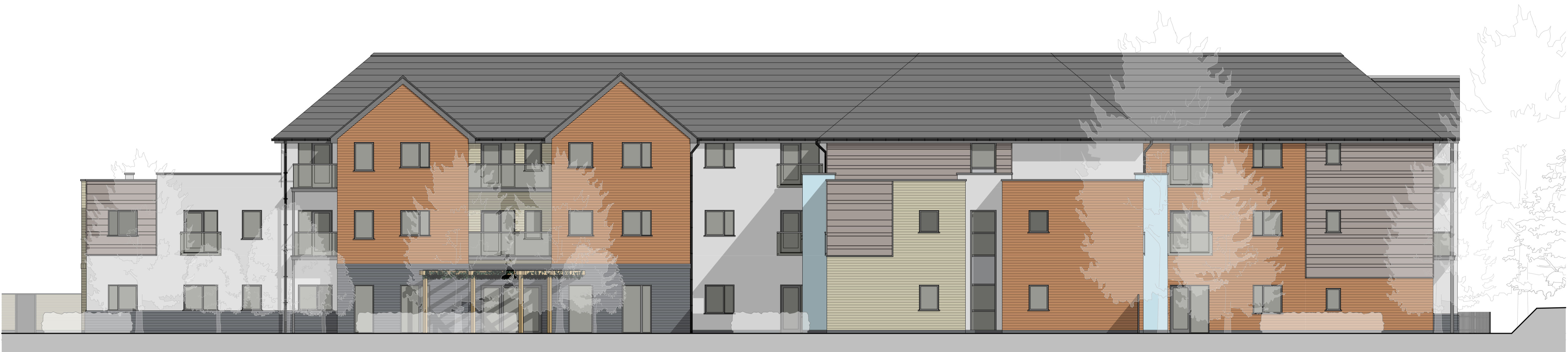
elevation 06 - communal garden