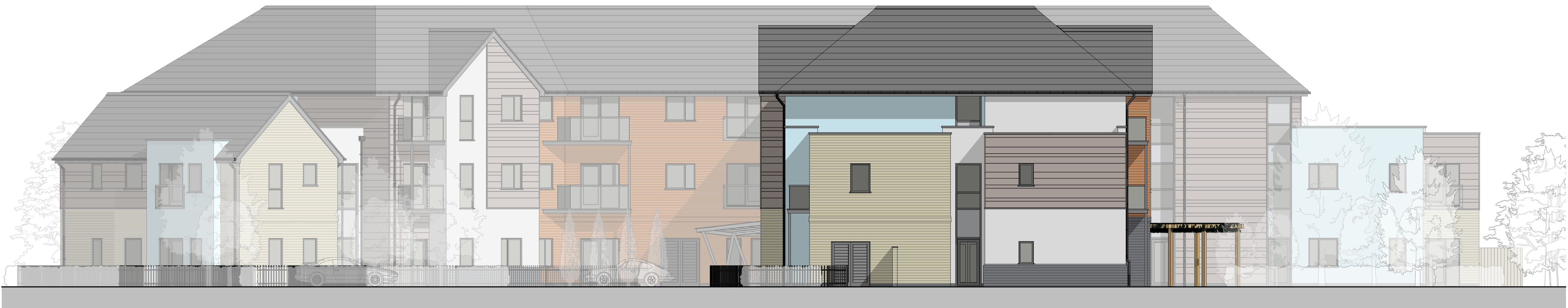
elevation 05 - side elevation A