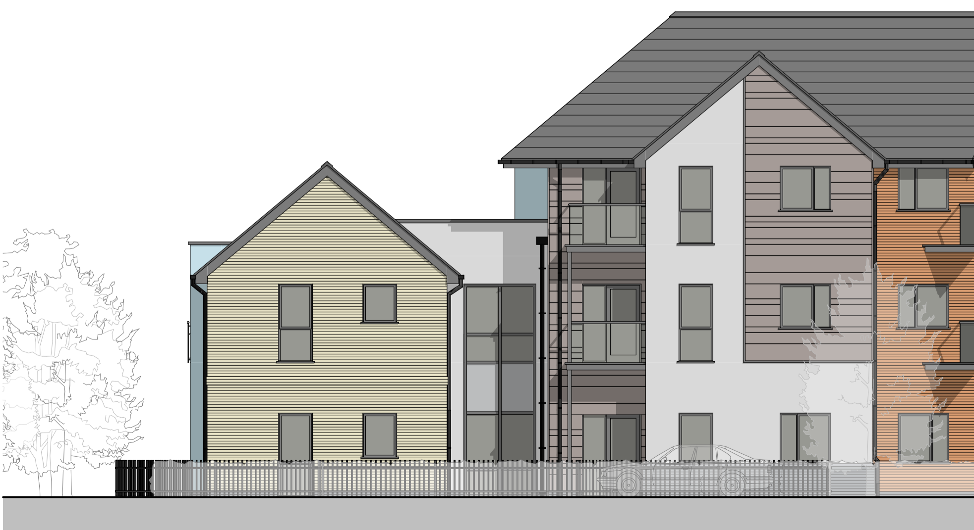
elevation 07 - entrance courtyard C