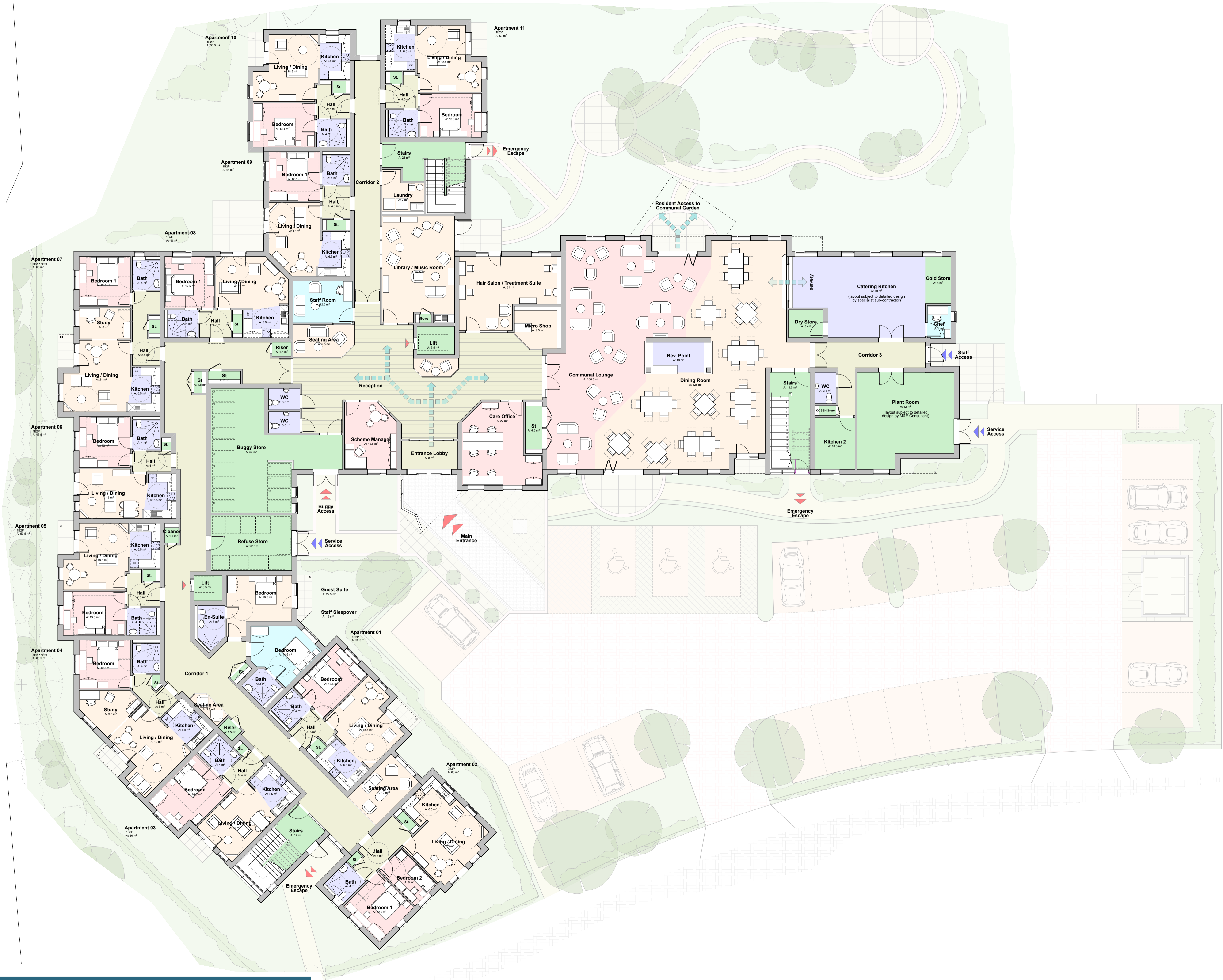
ground floor plan - as proposed