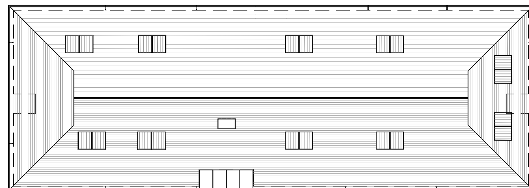
ROOF PLAN (1:200@A1)