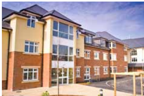
Artist's impressions are for illustrative purposes only.

Orchard Fields – Extra Care scheme in Banbury has 20 two bedroom apartments. Of these, 20 are available to purchase on shared ownership and 19 to rent. bpha is working in partnership with Oxfordshire County Council and OSJCT. This development was completed in May 2011.