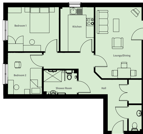
example of two bedroom apartment

Kitchen 3.43m x 2.60m Lounge/Dining Room 5.51m x 3.59m Bedroom 1 3.43m x 3.96m Bedroom 2 3.22m x 2.66m