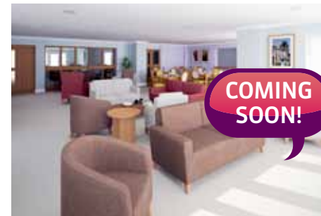
Artist's impression is for illustrative purposes and is only representative of final furnishings and finish.

Orchard Fields – Extra Care scheme in Banbury has 20 two bedroom apartments. Of these, 20 are available to purchase on shared ownership and 19 to rent. bpha is working in partnership with Oxfordshire County Council and OSJCT. This development was completed in May 2011.