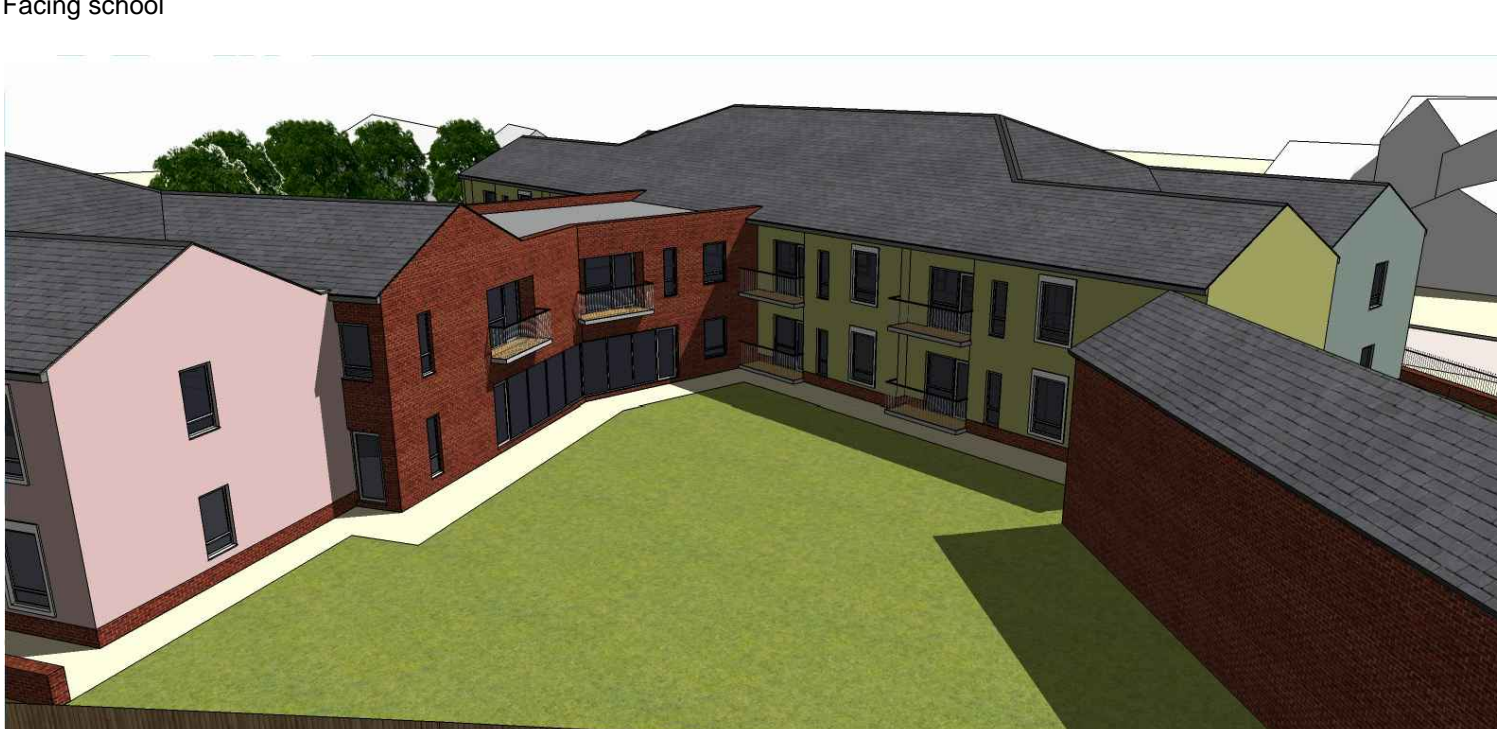
Communal garden Elevated views