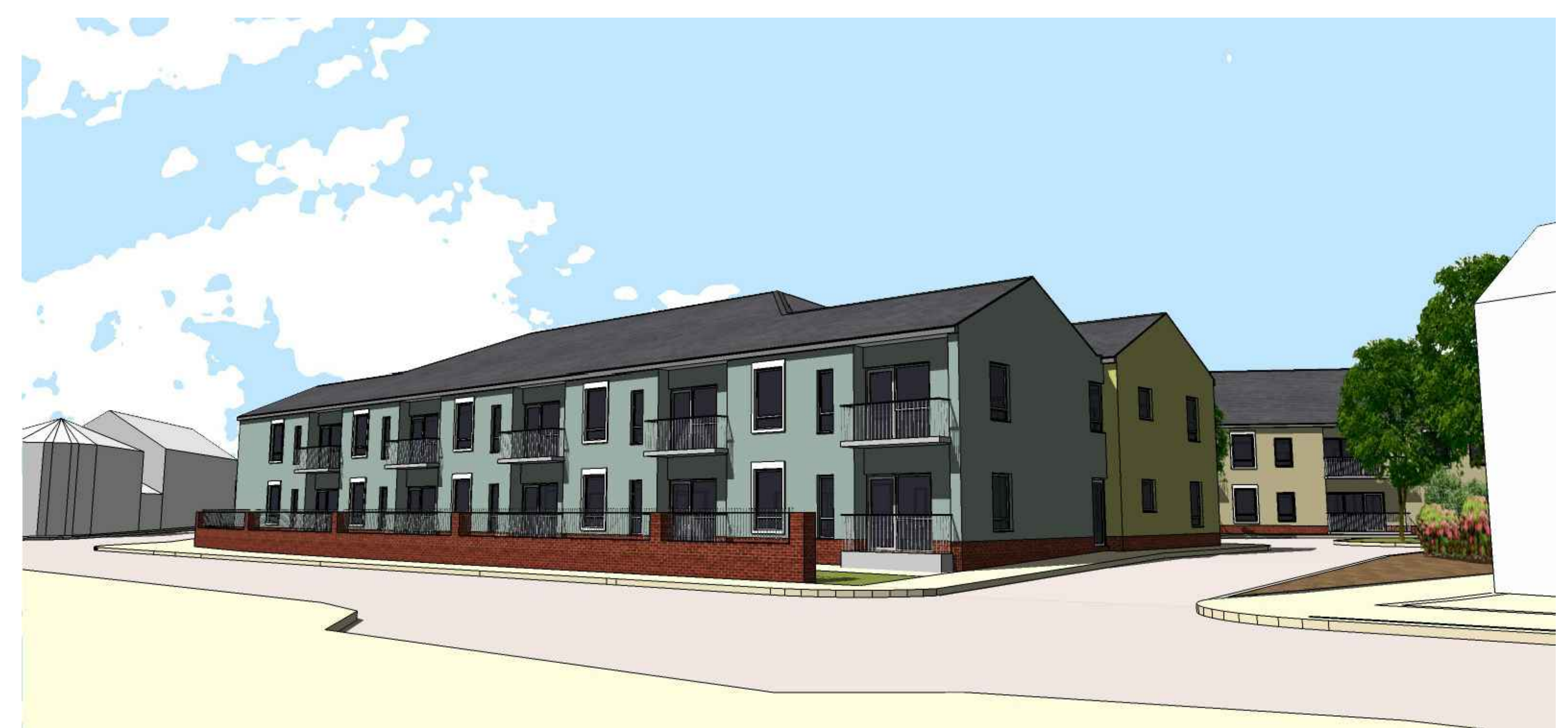
View from South End looking south